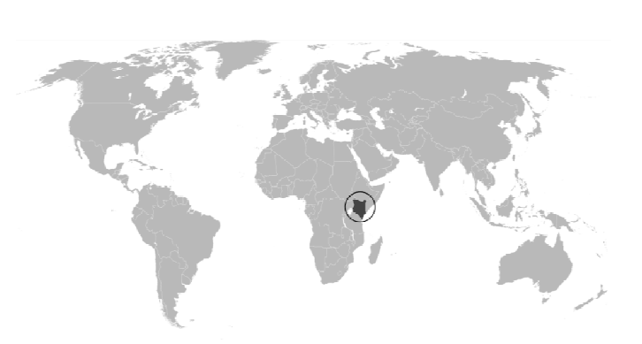
Fig. 1: Project location