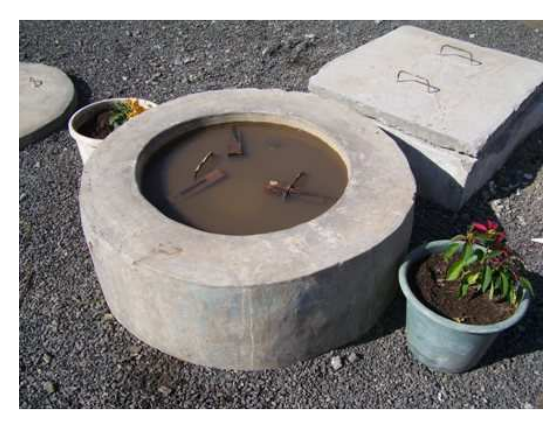
Fig. 8: Area of the top manhole (above biogas fixed dome) of the biogas plant. Clay is used for sealing the lid, and water to keep it wet and thus detect leakages that would show up as bubbles.

The biogas is piped (half inch galvanised iron pipe, i.e. 1.5 cm diameter) to a nearby café where it is used for cooking (5 meters away). A water trap chamber was installed next to the biogas plant to collect condensed water in the pipeline. There is a main valve at the gas outlet point outside next to the dome and a secondary valve inside the café before the stove. Attached to the piping in the kitchen is a simple manometer consisting of a water-filled transparent pipe to indicate the pressure in the system. This pressure shows the actual amount of biogas available for use (see Section 7).