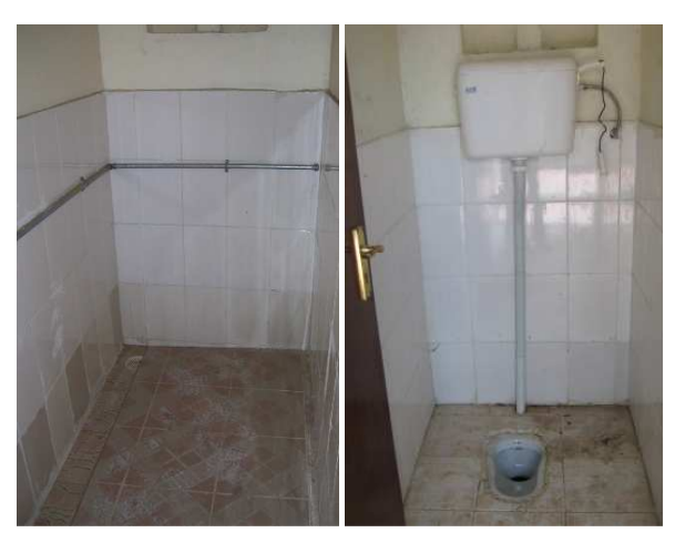
Fig. 6: Left: Urinal using a tiled wall (no door) with optional water flush. Right: Squatting pan with 10 L cistern (flush toilet); but these days a manual pour flush system is used for toilet flushing (see Fig.7).

The toilets are fitted with locally available standard ceramic squatting pans (without urine diversion). They were initially flushed with 10 L of water from locally available 10 L cisterns above the toilet. Due to shortage of water and repeated breaking of cisterns, the toilets are currently flushed by hand with a "pour flush" system. A small bucket is filled with 2-4 L of water taken from a small drum and is then poured into the toilet