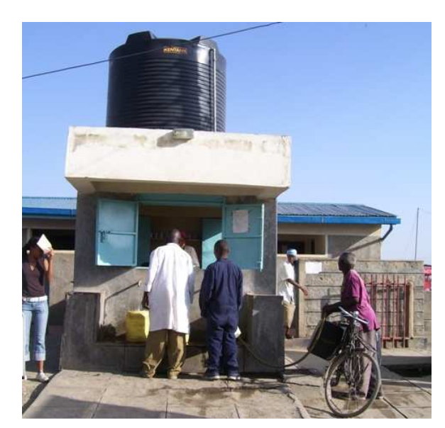
Fig. 5: Customers of the water kiosk. The water tank on the roof holds 5 m<sup>3</sup> (or 250 jerry cans) to bridge water supply gaps for a period of about 1-2 days.

The new facility comprises a sanitation unit (toilets, handwash basins, a urinal and showers) and a water kiosk. The facility is connected to the town water supply network and has three overhead water storage tanks to cater for short supply interruptions. The wastewater from the toilets, showers and hand wash basins is drained into an underground biogas plant that treats the wastewater an-aerobically (under the absence of oxygen) on-site. Treated effluent is discharged to the sewer<sup>4</sup>.