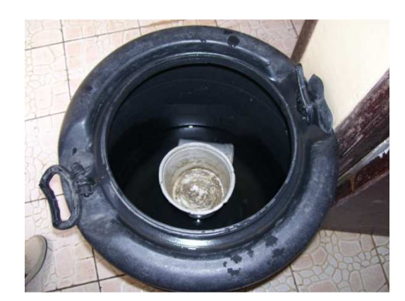
Fig. 7: Pour flush system with small bucket (2-4 L) in drum. The small bucket is used to flush the toilet.

The urinal consists of a tiled wall and trough with flushing device connected to a 10 L cistern. But the urinals are rarely flushed due to water shortage, hence odour develops occasionally. The operators clean the urinal wall and trough on an irregular basis.