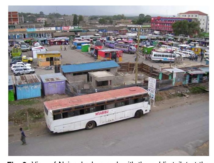
Fig. 3: View of Naivasha bus park with the public toilet at the front of the plot (behind the large bus); during the construction in mid 2007.

The overall aim was to achieve sustainability through capacity building within the institutional water sector institutions towards professionalism, efficiency and commercialisation. The focus of this document is the public toilet; the water kiosk system is also briefly described.