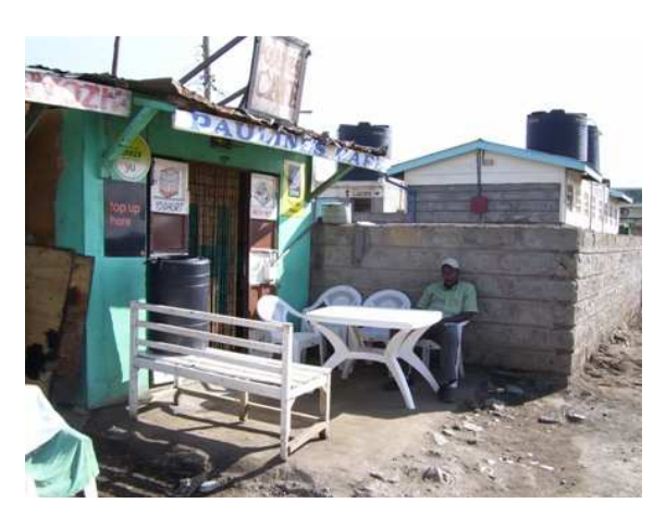
Fig. 11: The café that uses biogas for cooking is located adjacent to the public toilet.

The <u>treated effluent</u> (from the outlet of the biogas plant) could be used as a source of fertiliser and irrigation water, however it is not feasible here due to long transport distance to suitable agricultural areas.