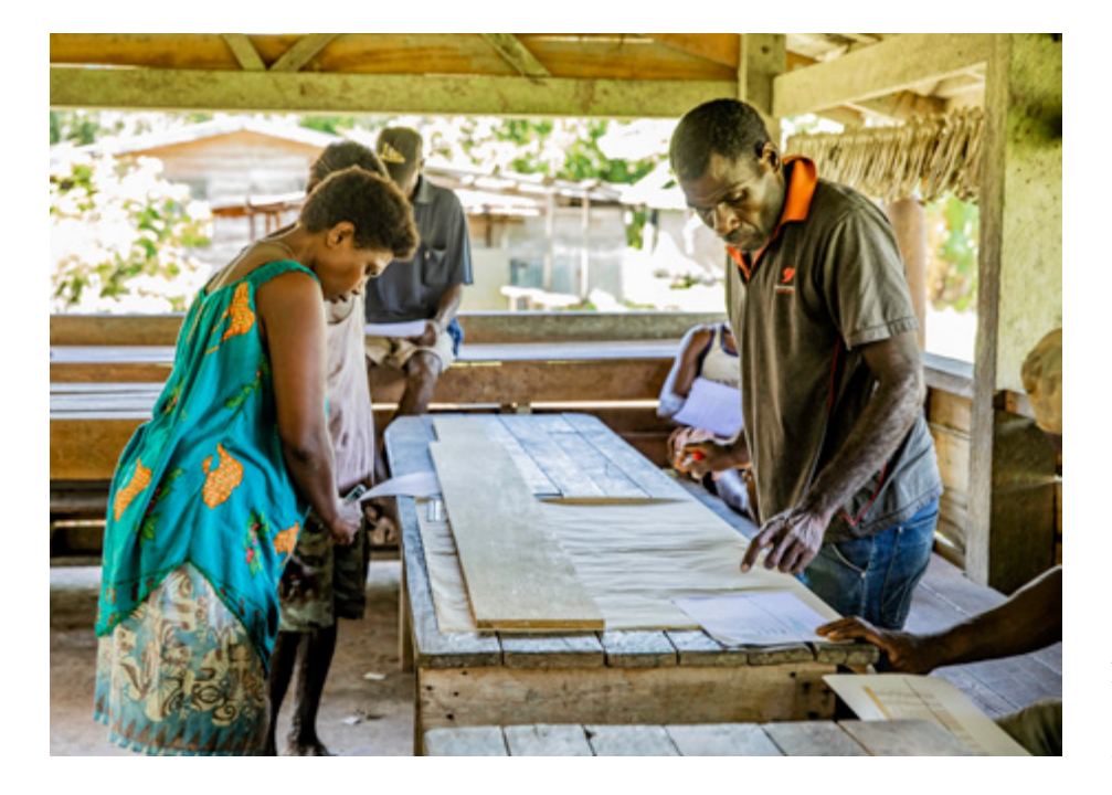
A WASH committee in Buka District, PNG, develop their Water Security Improvement Plan