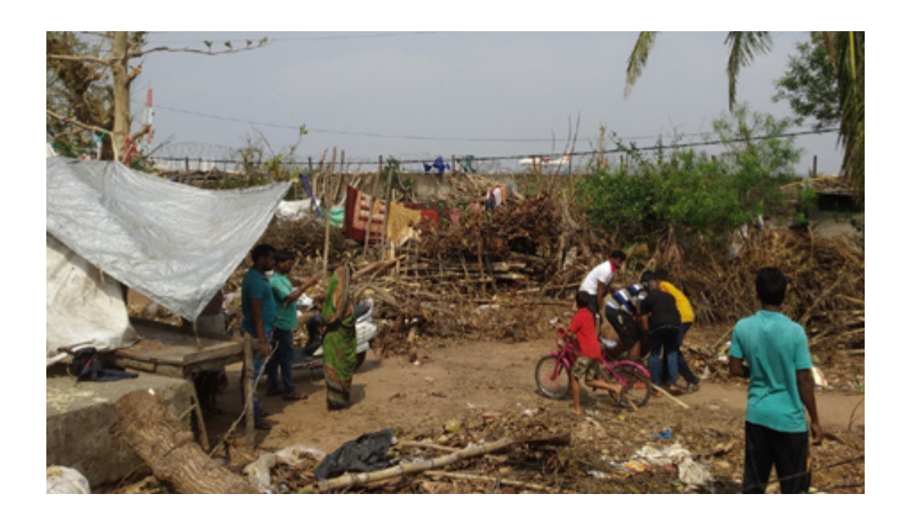
People survey the devastation caused by Cyclone Fani in Tarini Basti, an informal settlement in Bhubaneswar, India

A summary of example databases and data sources for each indicator is provided in Table 4 of Annex A.