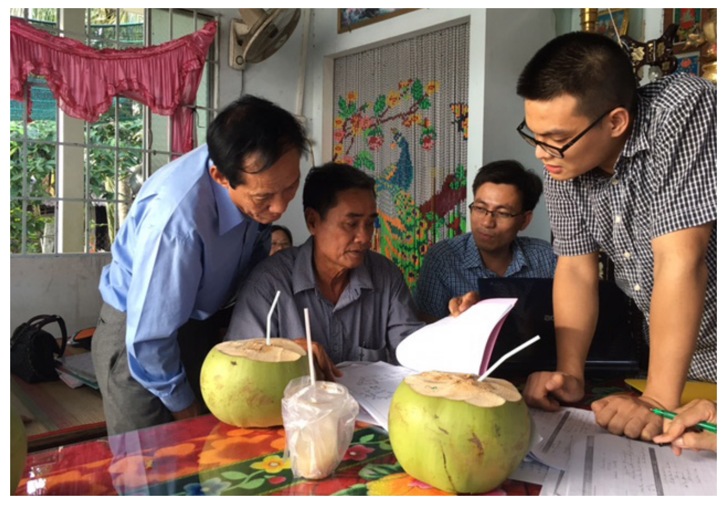
Enterprise owners, CSO and university staff conduct research in Vietnam on life-cycle costs analysis of piped water systems