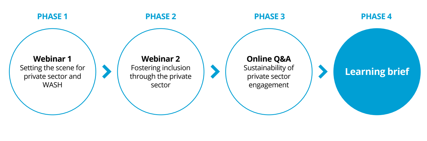
Figure 2. The four phases of the learning initiative

As part of Water for Women's Learning Agenda, the University of Technology Sydney's Institute for Sustainable Futures (UTS-ISF) and other Fund partners undertook a collaborative online learning initiative to better understand how CSOs and other WASH program implementers can engage with the private sector to improve inclusive WASH services and systems. The initiative took place from September to December 2021. It brought together over 70 participants from 20 CSOs and research organisations across South and South East Asia working with the private sector in their WASH programs, both within and external to Water for Women. While Water for Women partners are also working across the Pacific, there are few partnerships with the private sector in that region. Therefore, this learning brief focuses on South and South East Asia, though learnings are applicable beyond this region. The learning initiative involved engagement through various remote modalities (Figure 2). Participants were supported with a reading list, which included key resources related to private sector engagement in inclusive and sustainable WASH.