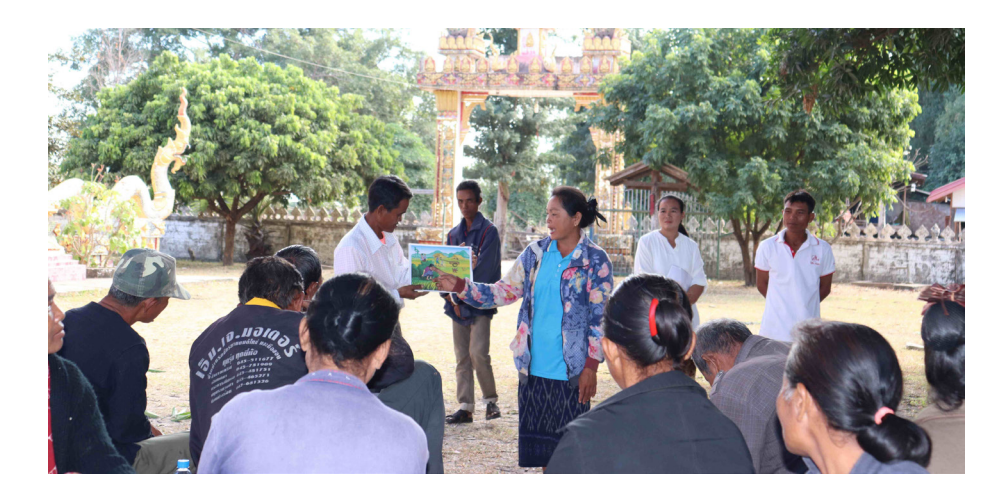
A sanitation promoter in Champhone District, Lao PDR, <u>explains the importance of a safe toilet</u> In