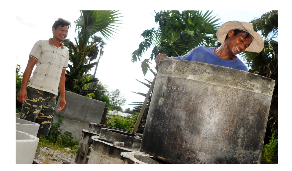
At a manufacturing site in Kampong Chhnang, Cambodia, latrine business team members produce cement rings for pits