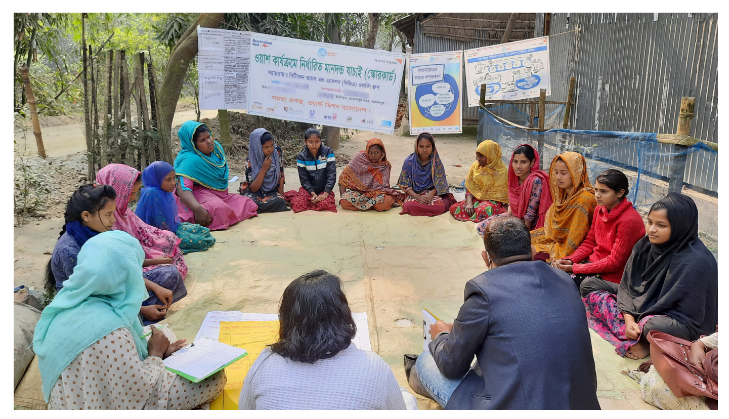
Women and girls review WASH progress in Jamalpur during a score card session

These insights and examples demonstrate that the way CSOs engage with WASH PMR can contribute to significant shifts in mental models and worldviews among other actors. By specifically helping government to link PMR to their own individual and institutional responsibilities, WASH can become a higher priority. By supporting charismatic and influential leaders to lead change, and by creating new relationships and connections between rights holders and duty bearers, CSOs can contribute to changes in how people understand the system and their role within it. These ways of working are especially important for shifting mindsets and norms for more gender equitable and socially inclusive WASH.