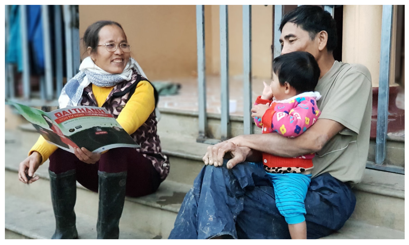
A member of the Vietnam Women's Union discusses building a hygienic latrine with a community member in Thanh Hoa province, Vietnam

Water for Women partner survey respondent