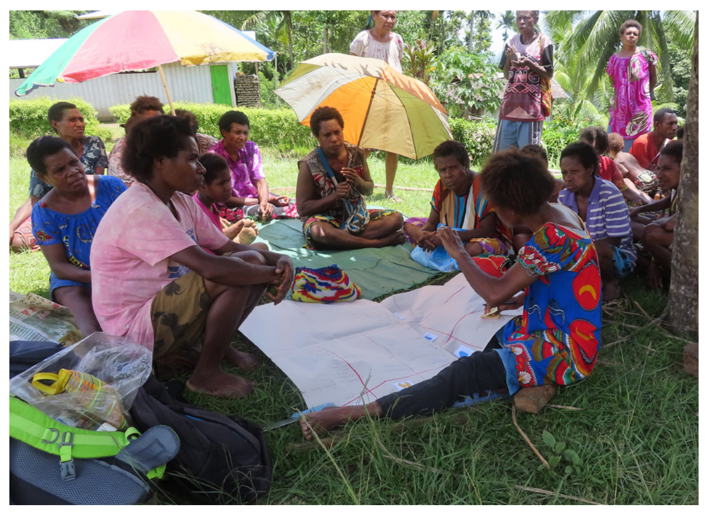
Community engagement on the Wewak District WASH Plan at Walandoum, PNG

WaterAid PNG helped to establish the Wewak District WASH Coordination Body (WCB), which brought together local government managers, district administration, provincial health assembly representatives and rights groups, including the Wewak Disabled People's Association and the East Sepik Council of Women to focus on WASH for the first time. These actors share information, and a culture of mutual commitment and accountability is emerging. The WCB was instrumental in the creation of the Wewak District five-year plan and in coordinating the COVID-19 response, with the insights of the women's group and OPD contributing to a focus on leaving no one behind. The leadership of the district administrator in this body has been key to success, due to their role as a formal leader but also because they are well liked, well respected and their connections with political leaders give them hidden power to advocate for prioritisation of WASH.