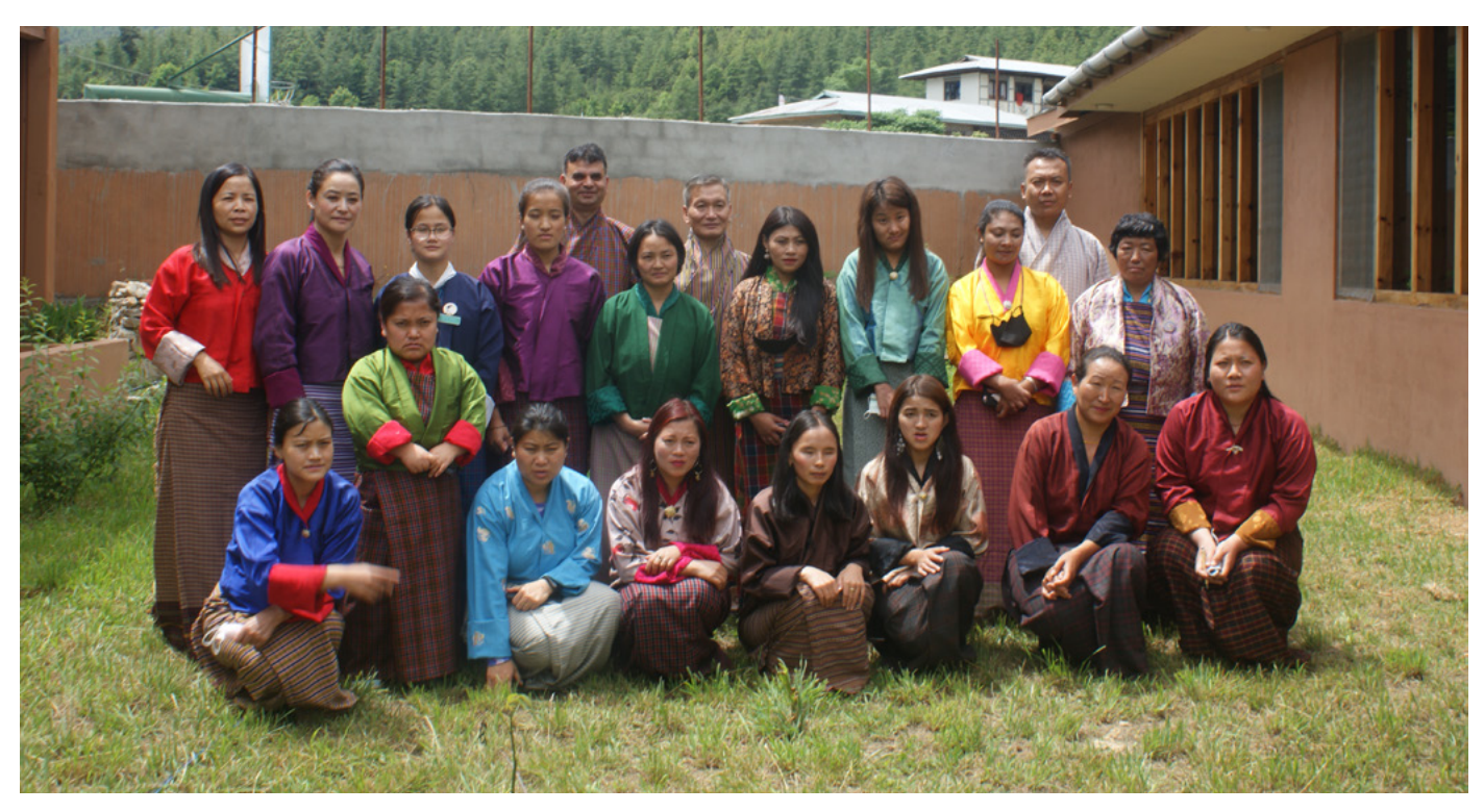
Leadership training for women with disabilities in Bhutan

According to ABS, the collaboration with SNV is 'increasing leaders' awareness about disability inclusion in WASH'. At national level, ABS has become a key player in the national WASH arena and is a member of the National WASH Technical Working Group led by the Ministry of Health and the Ministry of Works and Human Settlement. ABS staff have also been engaged in sanitation and hygiene promotion in districts, and Bhutan's WASH sector is benefiting greatly from ABS's comprehensive data on the prevalence of both visible and invisible disabilities and the contact details of the carers of persons with disabilities.