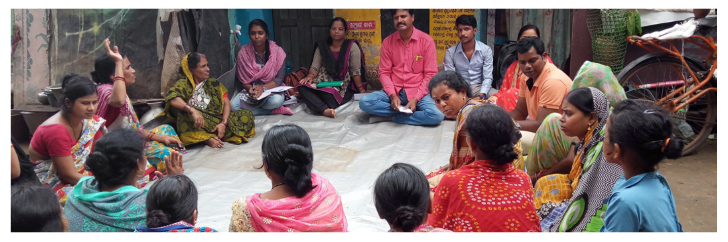
A community meeting in Bhubaneswar, India