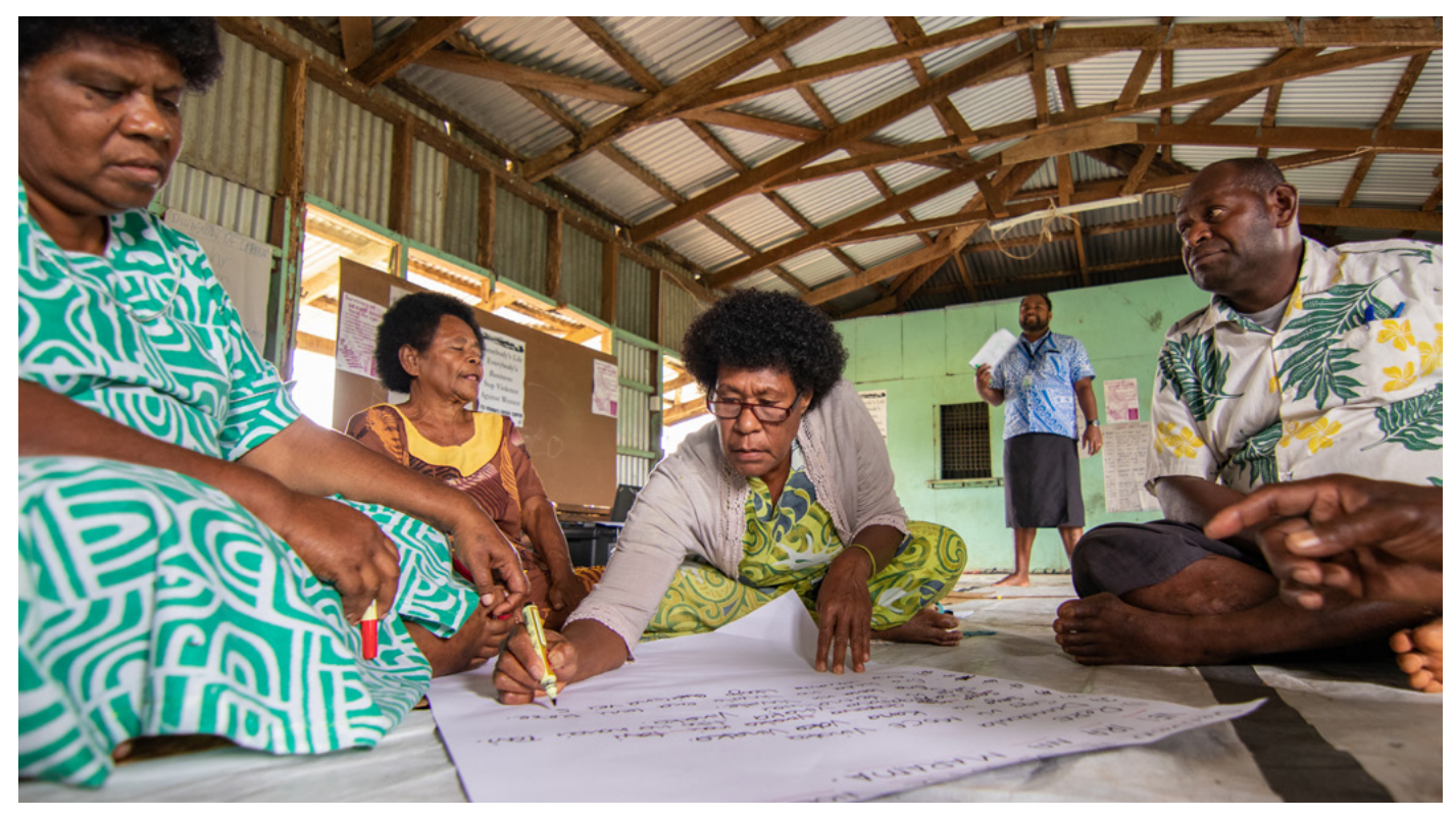
Participants in the Do No Harm pilot in Fiji where Water for Women partners with Habitat for Humanity

In the application of Do No Harm, Fund partners have developed a strong understanding that 'doing nothing is doing harm'. If projects are not actively looking at ways to reduce inequalities and champion the voices of women and the marginalised, then they are doing harm, because they are implicitly reinforcing the social and gender inequalities already in place. For this reason, partners have developed their own nuanced and contextually appropriate Do No Harm strategies that ensure they are actively identifying and addressing risks of backlash and resistance when supporting the voices and agency of the less powerful to conduct dialogue with the more powerful.