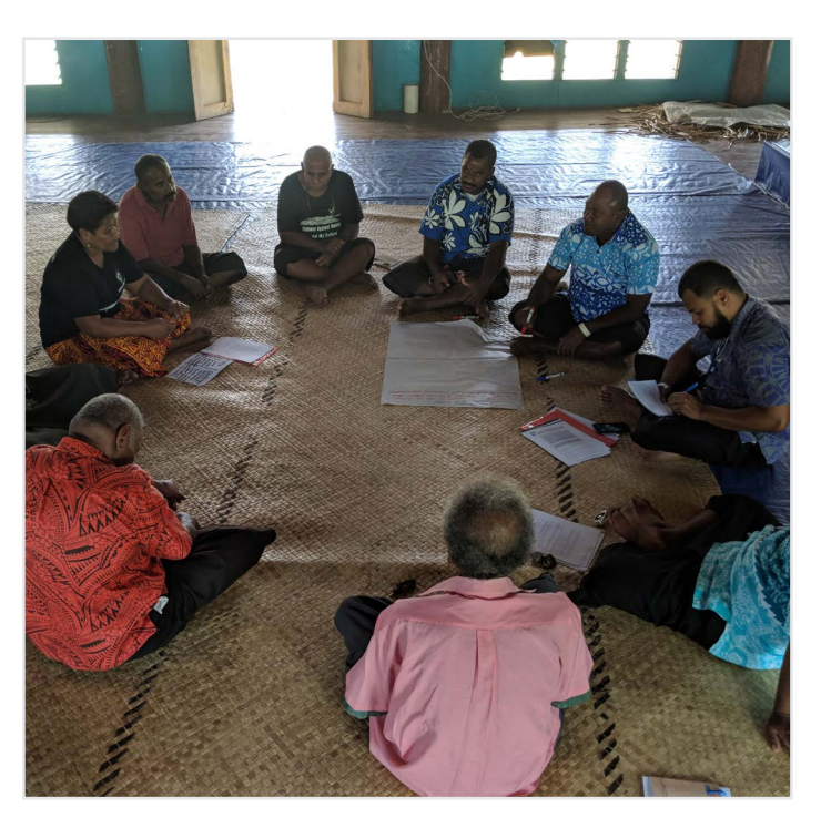
Men's group discussion on benefits, challenges and solutions for women participating in WASH activities