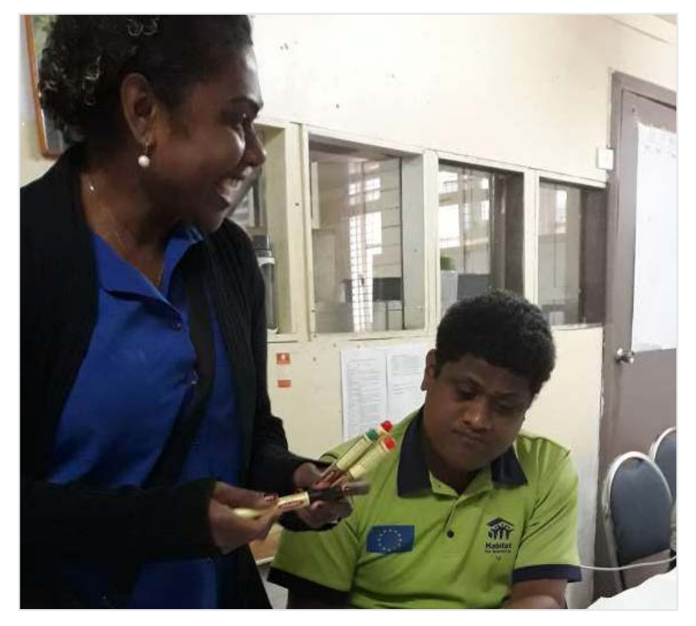
Do No Harm training for Habitat staff