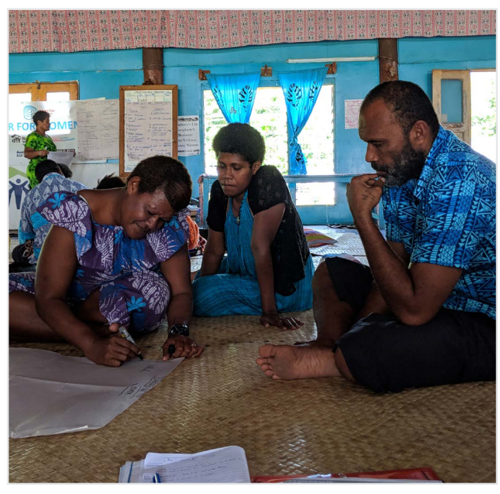
Mixed group discussion in Nacula community