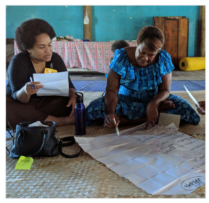
Habitat staff and women in Nacula Community

A strong theme coming out of the pilot was the need to strengthen monitoring processes which can capture the quality of women's participation, and this is not just in terms of how they are participating in WASH activities. Monitoring with a Do No Harm lens means that this is broadened out to include the level of men's support for women's participation, which is integral to women's agency and wellbeing. This will also help the WASH project and staff to be alert and respond to any unintended consequences related to resistance and backlash, as a result of women's increased participation.