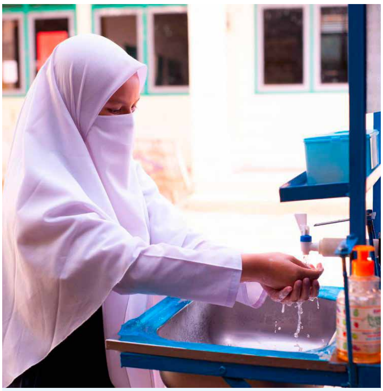
A student washes her hands at a newly installed handwashing facility at her elementary school in Aceh Province

UNICEF is grateful to key partners, including the Government of the United Kingdom, for its support to keep the most vulnerable children healthy and protected during the COVID-19 pandemic.