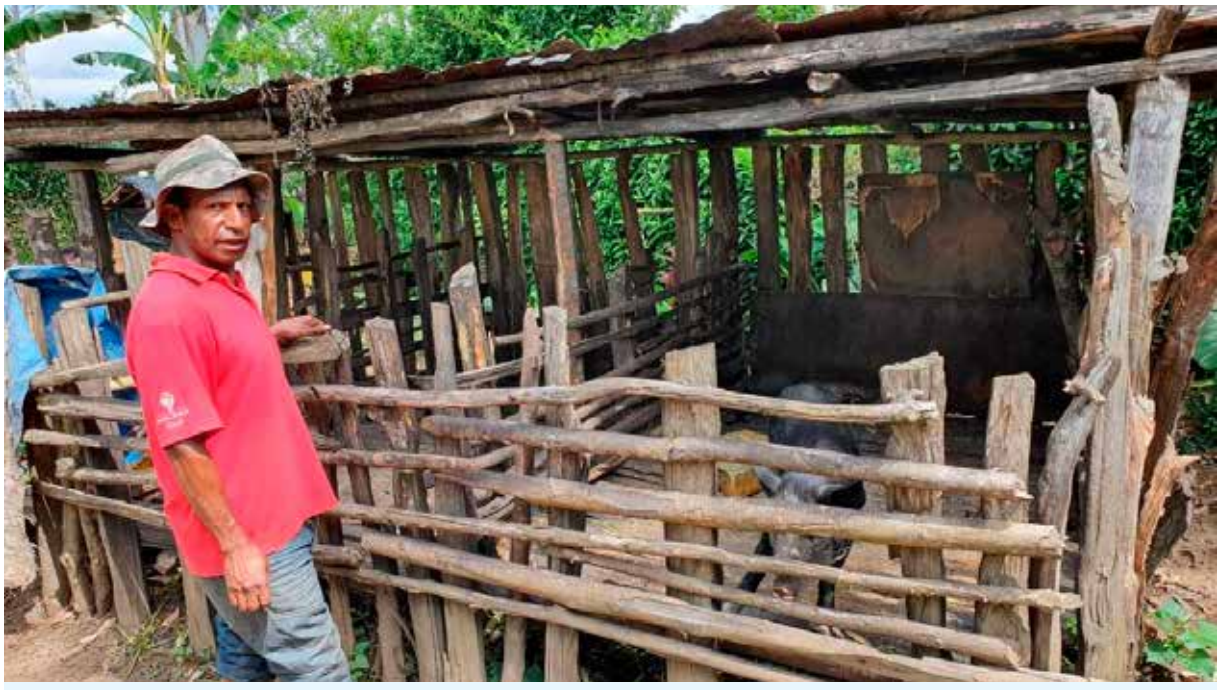
A villager in Pami village in Hagen Central District shows off a pig pen he built to stop his pigs from defecating around his home

Communities also learn the importance of separating degradable and non-degradable garbage and how to effectively dispose the latter. Household garbage, such as cans and plastics, are disposed of in a pit while biodegradable waste is used as fertilizer for the garden.