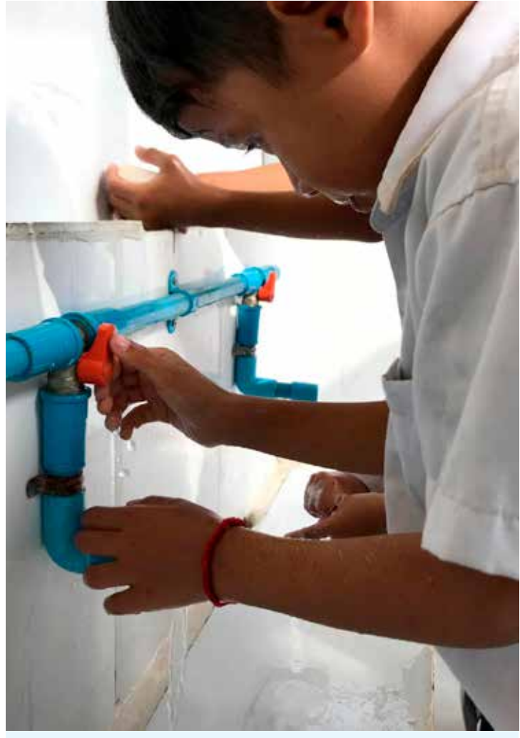
Boy at Ang Roka Primary School washes his hands in the new facilities supported by UNICEF

The impact of the new sanitation systems appears to have been swift, with the school's records indicating that absenteeism has dropped since the new WASH system was built, particularly among the teenage girls who were most affected by the previous poor set-up. In fact, the school's excellent facilities have become so well known that more than 30 children have transferred to the school to access them, which has in turn generated healthy competition among the different local school WASH Committees.