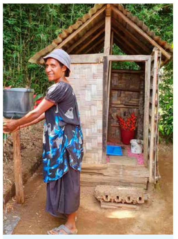
A woman washing her hands beside her new toilet in Pami village, Hagen Central District

in Morobe and Central Bougainville in the Autonomous Region of Bougainville. The project is also empowering 800 pilot communities to eliminate open defecation by building toilets for their homes and consistently using them. UNICEF is working with partners to support government efforts and replicate best practices in other areas of Papua New Guinea. Open defecation leads to faecal contamination of communities' water sources and food produced by households, such as vegetables and fruits, some of which are eaten raw.