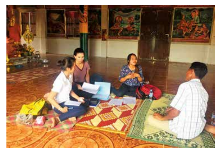
KII with Commune Chief in Kampong Thom

Overall, in sampled rural Cambodian communities, improved household sanitation outcomes were strongly associated with factors of collective efficacy and somewhat associated with bonding social capital. Linking social capital was somewhat associated with community ODF status, but was not associated with household-level sanitation outcomes; no association was found between outcomes and bridging social capital (Figure 2). Bonding social capital is evidenced in rural Cambodian communities by the extent to which village members are included in both community and personal events as well as by the presence of strong kinship bonds. Linking social capital can be seen in the integral roles and responsibilities held by local leaders, particularly as liaisons between outside organizations or resources and the community. In contrast, bridging social capital was not as strong in the sampled villages, leaving the responsibility of addressing community needs to local village authorities where community groups and organizations were lacking.