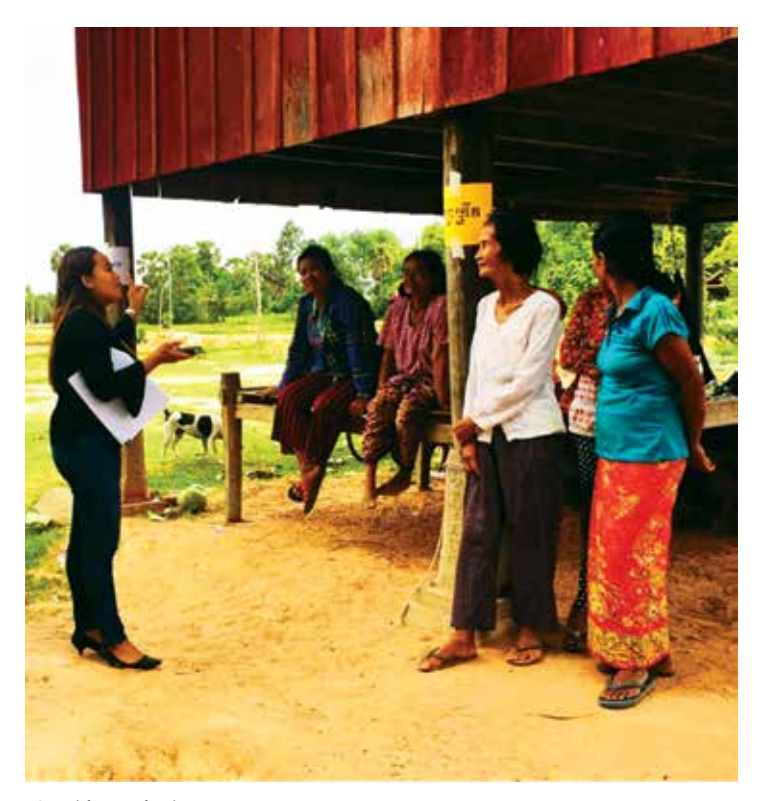
FGD with Females in Kampot

The qualitative component of the study consisted of 19 key informant interviews (KIIs) and 12 focus group discussions (FGDs) across six provinces of interest (Kampong Speu, Kampong Thom, Kampot, Kandal, Kratie, and Takeo). The Klls and FGDs were designed to better understand perceptions of social capital and collective efficacy and contextualize the quantitative findings. The KII participants included local authorities and particularly active community members who were identified as key informants by a local authority. Focus group discussions were held with one group of 8-10 women and one group of 8-10 men in each of the seven villages selected for qualitative data collection.