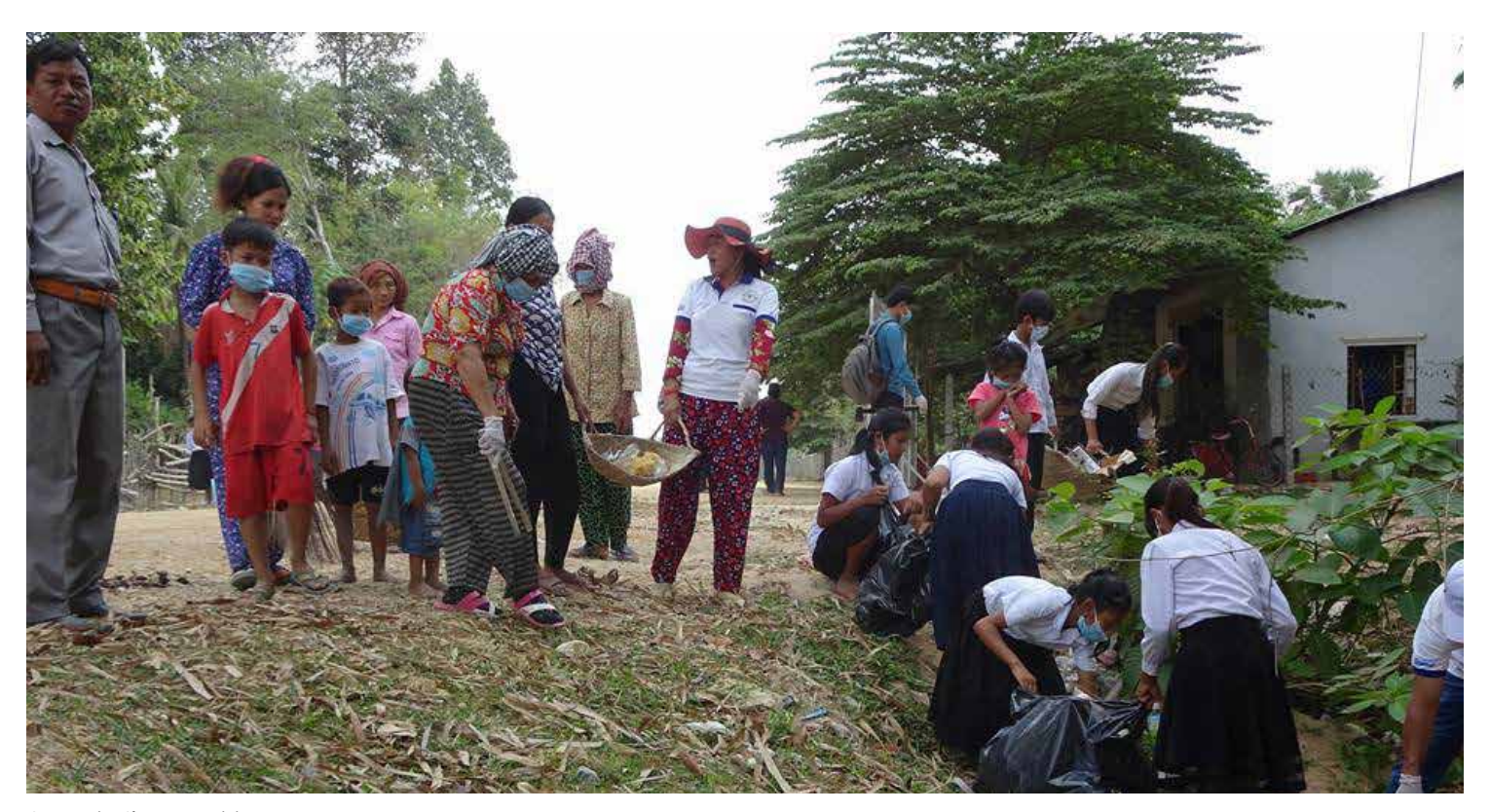
Community Clean Up Activity

Linking social capital is defined as vertical linkages, such as relationships between people or institutions with unequal power or resources.