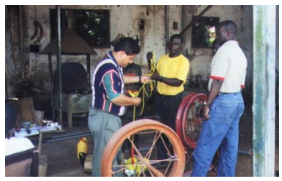
The production of the first pump in Sindigo, Savelugu District, Northern Region of Ghana.

Following the CWSA visit to Nicaragua, the WSP agreed to fund a threephase transfer process. Under the first phase in 1999, BOMESA helped identify several Ghanaian workshops suitable for the production of the rope pump. The local availability of materials required for manufacturing was confirmed while some parts (such as the ceramic guide box and the pistons) were supplied from Nicaragua during the initial phases of the transfer. The capacity for producing these parts in-country was found to exist and will ensure long-term local supply. Production has now commenced in Ghana and several pumps have been success-