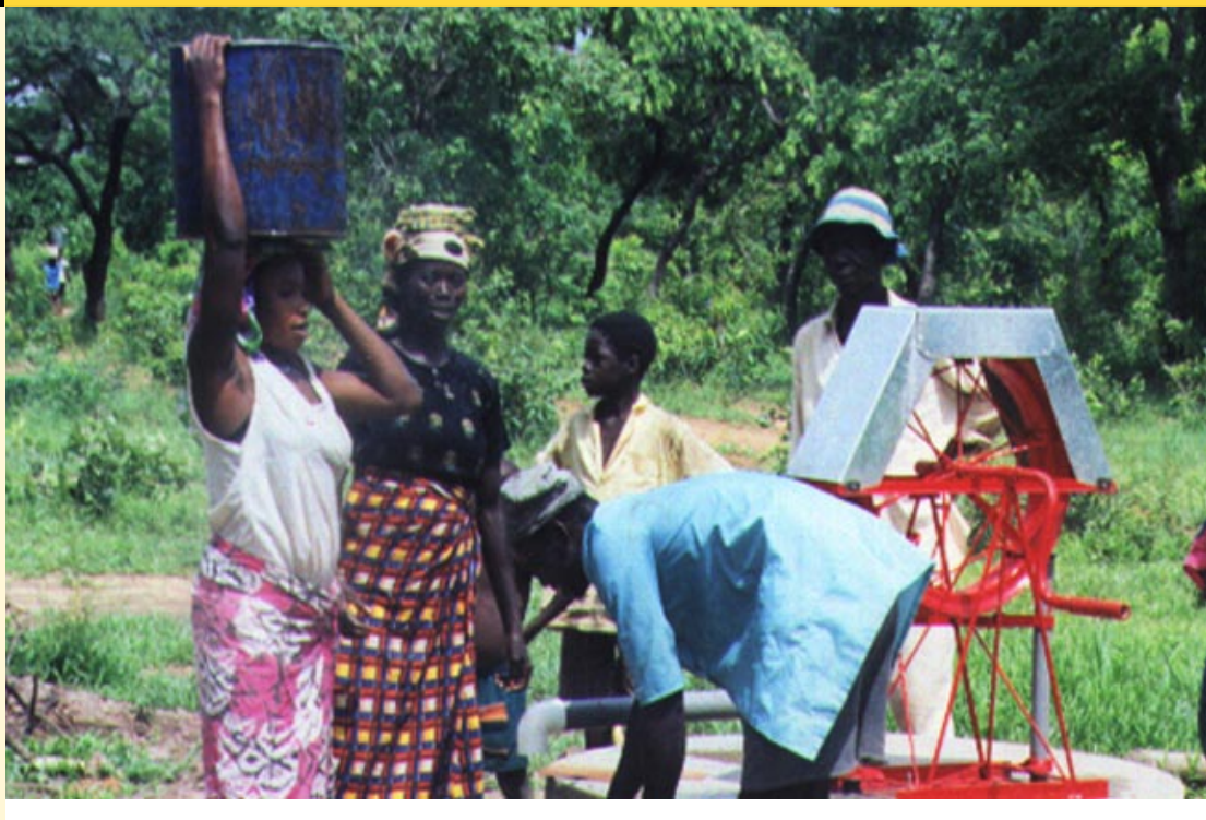
Users of Ghana with their new pump.