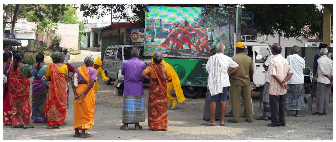
Figure 5.1: Kakkaman film screening at Narasimhanaicken-palayam