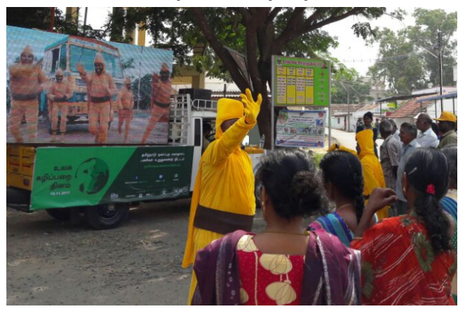
Figure 5.5: Video screening in public places in Periyanaicken-palayam