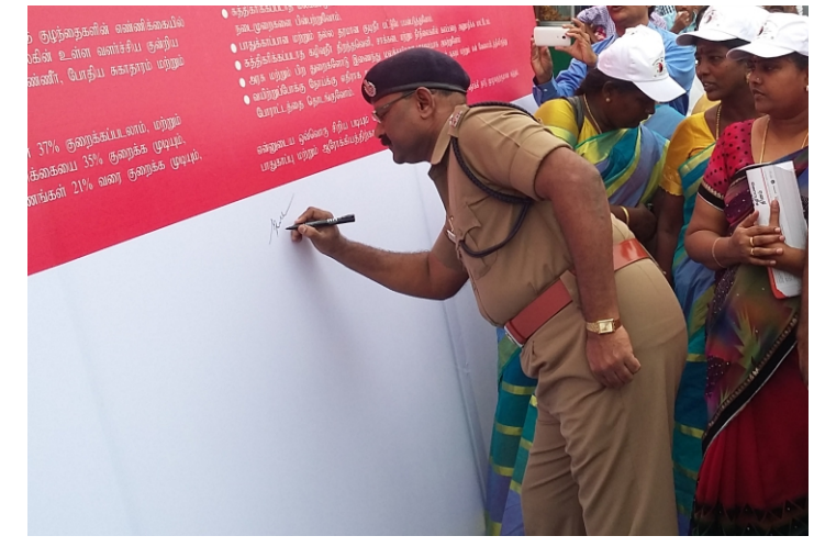
Figure 4.6: Deputy Commissioner of Police, Trichy inaugurating the signature campaign

The Deputy Commissioner of Police inaugurated the signature campaign at the central bus stand with messages on improving personal hygiene and sanitation practices. Signature boards were kept in four prime locations in the four zones of Tiruchirapalli Corporation limits for people to read and sign below. People who participated in the campaign were appraised about sanitation, fecal sludge and septage management (FSSM), its linkage with health, and the importance of treatment facilities.