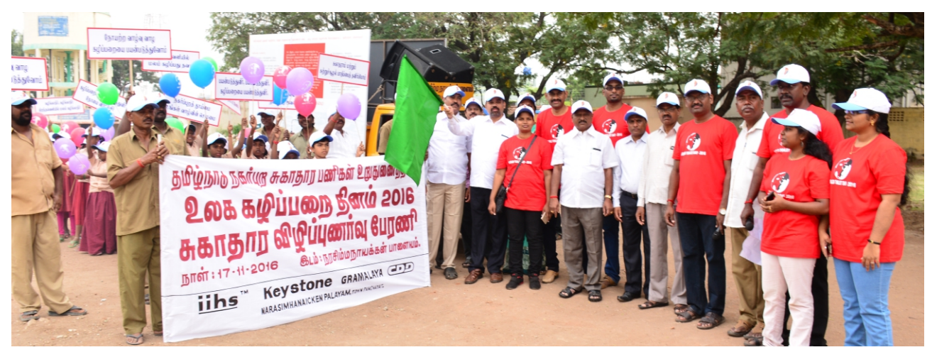
Figure 4.8: ADTP of Coimbatore inaugurating the awareness rally

A procession around the Narasimhanaicken-palayam Town Panchayat along with slogan chanting on sanitation was organised with 200 participants that included schoolchildren, members of self-help groups and sanitary workers. A vehicle equipped with public address system displaying sanitation messages led the awareness rally. Pre-recorded audio messages on the importance of improved sanitation were played as the vehicle went around the Town Panchayat. At the end of the procession, a quiz contest was held and participants were given prizes for correct answers.