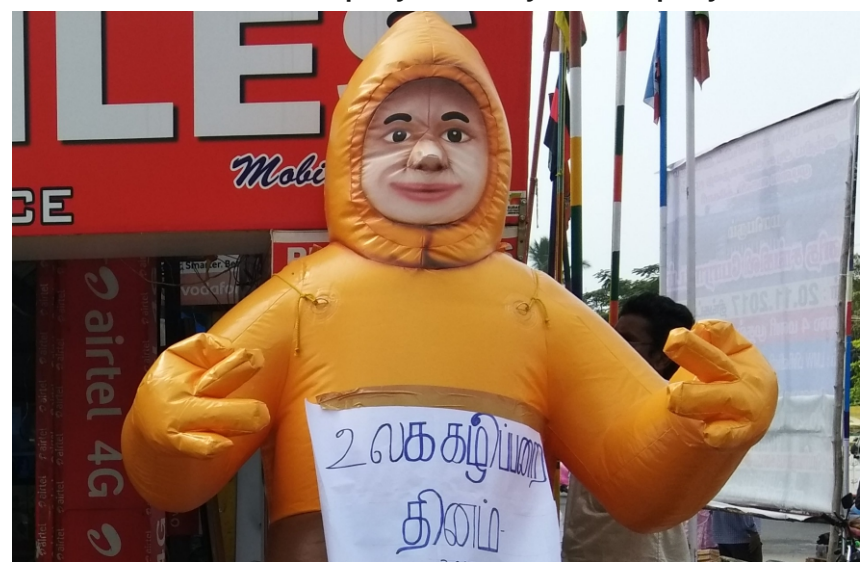
5.3. Kakkaman balloon

Figure 5.2: Balloon symbolising Kakkaman placed in Narasimhanaicken-palayam & Periyanaicken-palayam