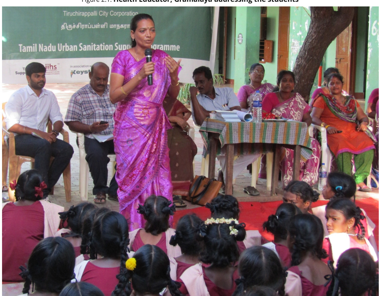
Figure 2.1: Health Educator, Gramalaya addressing the students

School children, being among the most impressionable members of the society, are seen as change agents when effecting any kind of behaviour change or socially relevant programmes. Therefore, TNUSSP decided to work with children, promoting them as change agents to inculcate healthy sanitation practices and to influence behaviour change in their families and in the community. SSHP programme was seen as an important means of implementing TNUSSP's BCC strategy. Children studying in both government and private schools from Grades 6 to 12, in Tiruchirappalli Corporation, Periyanaicken-palayam and Narasimhanaicken-palayam Town Panchayats of Coimbatore were the target groups of the programme.