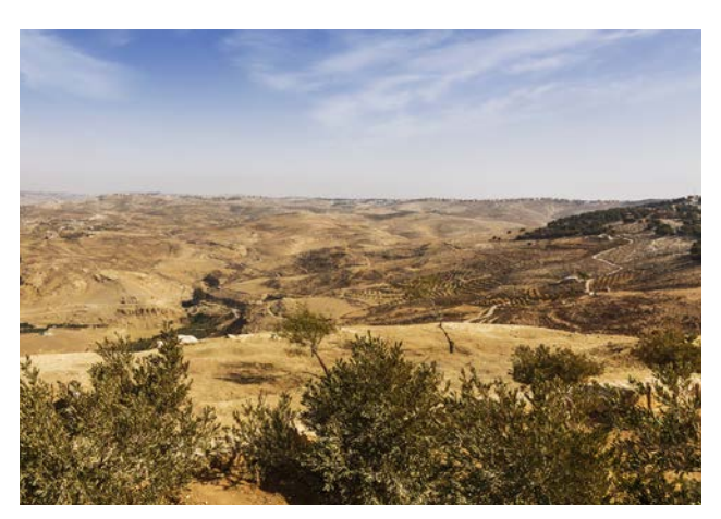
Jordan is one of the world's most water-scarce countries. About 75% of the country can be described as having a desert climate with less than 200 mm of rain annually.

The results showed that, on average, the entire urban water cycle of the city of Madaba generates 28,000 tons CO_2 -eq per year. Most of the utility's electric energy consumption, 71%, comes from the drinking water abstraction stage. In Jordan, most of the water lies deep beneath the surface. The process of drawing water from its source (the Waleh and Heidan wells) requires large amounts of energy. Distribution to the end-user further increases this cost.