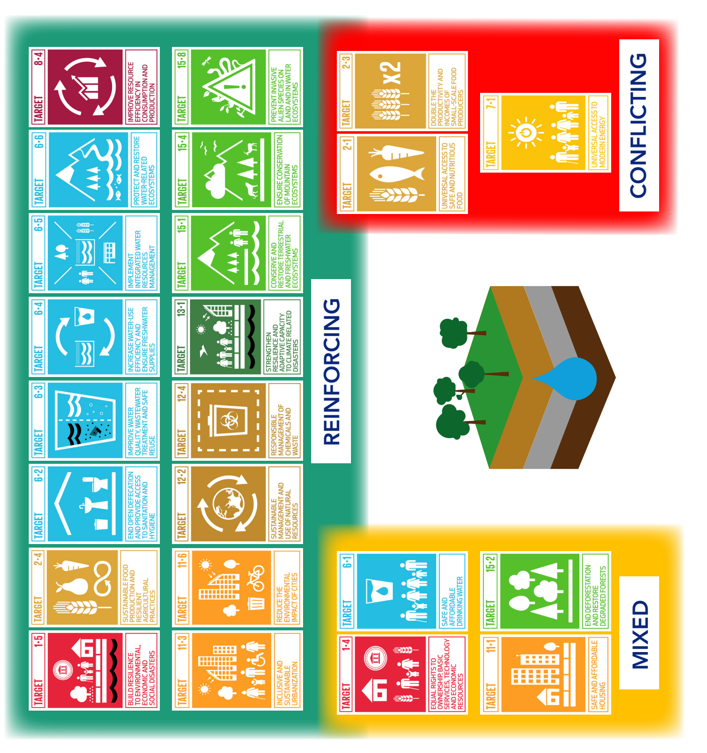
Figure 2. Categories of primary interlinkages between groundwater and SDG targets.