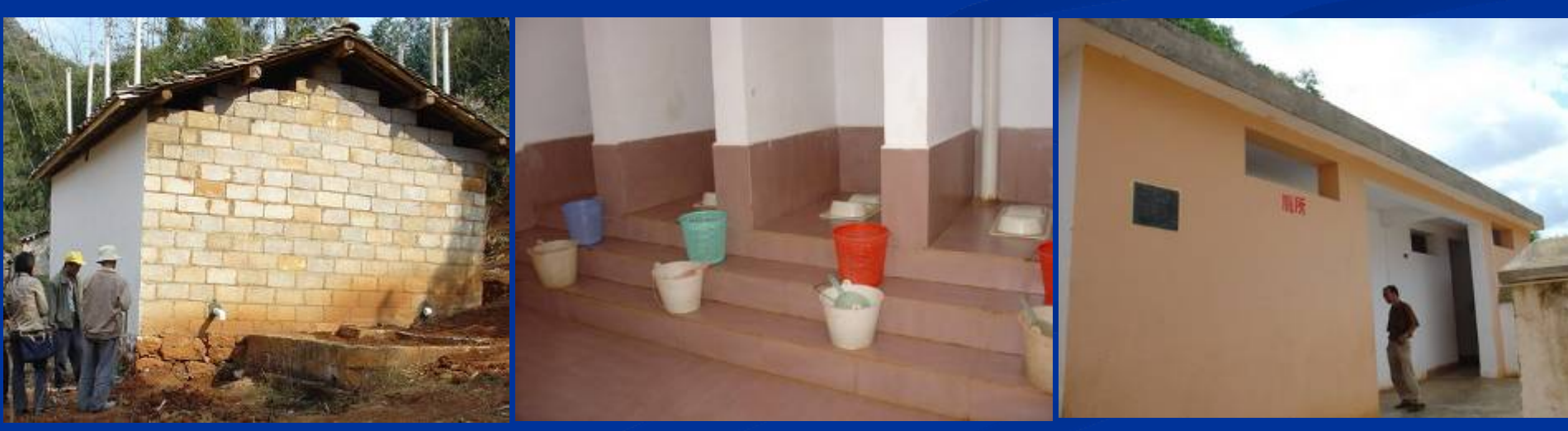
Toilet in Caihuaqing village

Two toilets with 8 or 10 pits in two schools in lakeshore villages