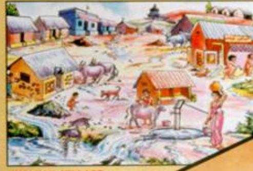
UNCLEAN VILLAGE "HELL ON THE EARTH"