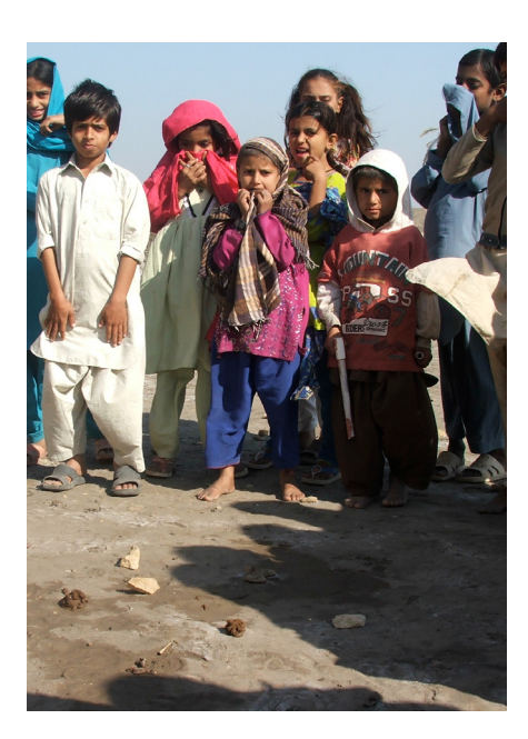
Triggering at Shahbaz camp, Hyderabad, Pakistan. In 2010, Pakistan was hit by its worst natural disaster when massive flooding affected an estimated 20 million people.

Four of the groups subsequently developed action plans for change, which incorporated: