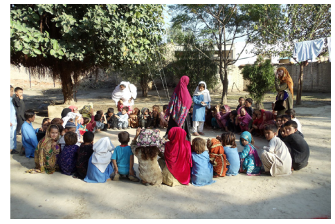
SLTS and triggering sessions at Peshawar.