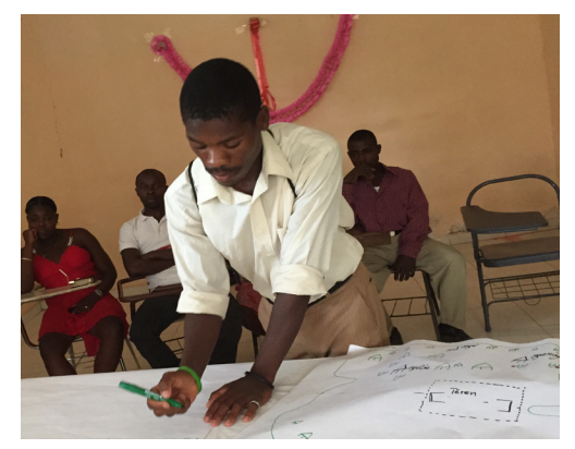
Natural leader in action in Haiti, 2015.