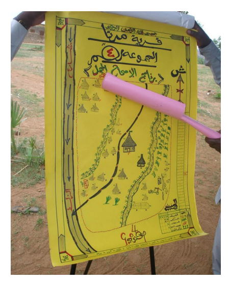
Village map prepared by the community.

The participating community prepares an action plan based on mapping, sanitary inspection (incorporating a physical inspection of public WASH facilities using a sanitary inspection checklist, along with water quality testing strips), sanitation and hygiene promotion, and group discussions). The Community Action Plan (CAP) addresses the entire community, since OD and poor hygiene practices affect all of the population. Hence, the CAP also incorporates a plan for improving WASH access at schools and health centres.