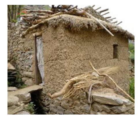
Kapisa, Afghanistan, post-CLTS implementation.