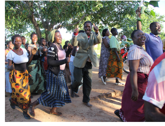
CLTS triggering in Malawi, May 2015.

There is also a clear need for sensitivity when triggering. the strong emotions it can bring up could be detrimental to the process (Balfour et al), and may not be appropriate or ethical in situations where people have experienced recent shock or trauma (Polo). As always, context critical: facilitators be experienced must understand and context and culture before implementation. A recent