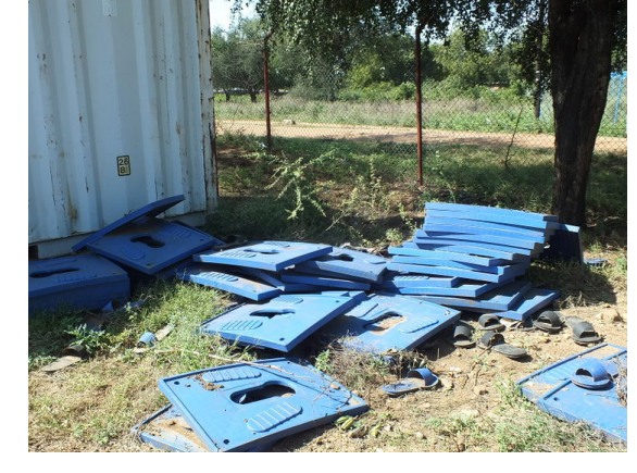
Unused slabs at a store in Kapoeta South, South Sudan because of no follow-up by the donor.