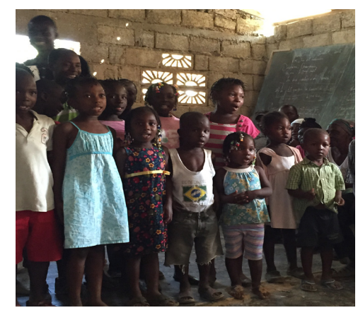
Children signing no more 'caca par terre' at a CLTS trigerring in Haiti in 2015.

<sup>4</sup> CATS was coined by UNICEF in 2008 to capture the variations of sanitation programming across its country offices including CLTS in Sierra Leone, School Led Total Sanitation (SLTS) in Nepal, and the Total Sanitation Campaign (TSC) in India. Many of the programme designs were inspired by CLTS and similarly aimed for open defecation free (ODF) villages with one of the key distinct features to CLTS being government's involvement from the start.