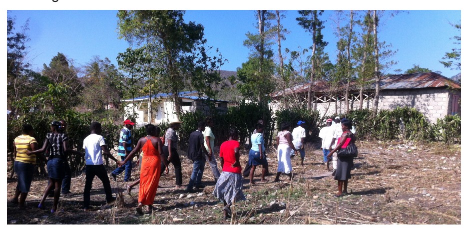
Transect walk, Haiti, 2015

In rural sites where no latrines exist, family latrines are normally accepted as the most appropriate, sustainable option due to issues of ownership and day-to-day management. However, overall most progress was seen in sites which already had latrines, particularly in respect of families cleaning toilets.