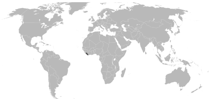
Fig. 1: Project location