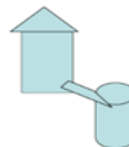
Fig. 4: Slabless VIP Latrine Design

The Slabless VIP latrine's pit is offset from the superstructure, reducing the need for an expensive concrete floor and lowering the risk of floor collapse ( IWASH Products and Services Guide, 2012 ).