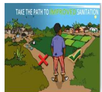
Fig. 7: Sanitation Marketing Billboards

Various IWASH-supported billboards promote safe sanitation practices (IWASH Annual Report, 2013).