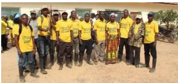
IWASH natural leaders gather at a Global Communities Ebola prevention event in Lofa County (Global Communities file photo, 2015).

champion (described below). Network members whose communities are sliding back into open defecation are not permitted to attend network meetings and are not allowed to trigger other communities or participate in important events until their community ODF status is regained. This strategy