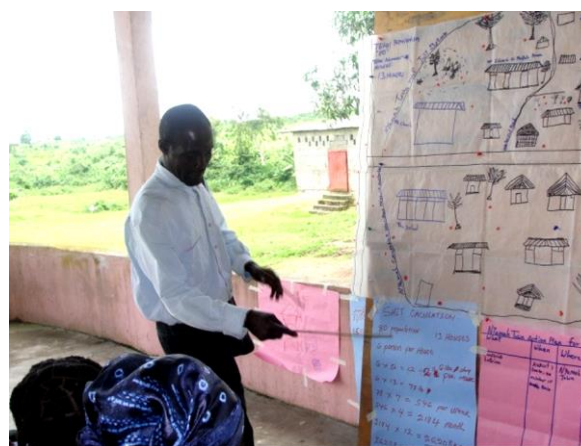
Fig. 3 An IWASH facilitator conducts a community mapping session at a CLTS workshop (WASH Semi-Annual Report, 2010).

This case study will focus on the program’s employment of Community-Led Total Sanitation (CLTS) , which promotes transformative, community-driven behaviour change to eliminate open defecation. Global Communities developed an innovative “ CLTS+ ” approach by tailoring the proven CLTS methodology to community-specific needs in order to create a more sustainable and scalable program model for some of Liberia’s most vulnerable communities.