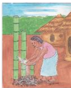
The Reed-based handwashing station offers a low-cost, locally available handwashing option for IWASH participants ( IWASH Products and Services Guide , 2012).

Other Technologies: As part of the CLTS+ model, natural leaders and WASH entrepreneurs also promote a range of well-established tools to improve community access to safe water, sanitation and hygiene, and their use is required for ODF verification. These include: