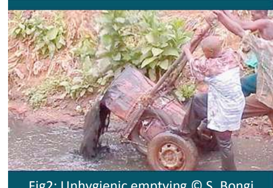
Fig2: Unhygienic emptying

Secondly, there is manual emptying by a third party that is contracted in. This rarely involves more than