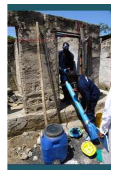
Fig 3: A hygienic emptying team in action in Dar es Salaam

Obviously the first of these methods, where the household arranges the emptying, could not be classified as 'sanitation as a business'. The other two approaches, given that they often involve privately contracted individuals or firms, often are. Those working to improve sanitation – central and local governments, donors, NGOs, private foundations – generally aim to reduce the risks of