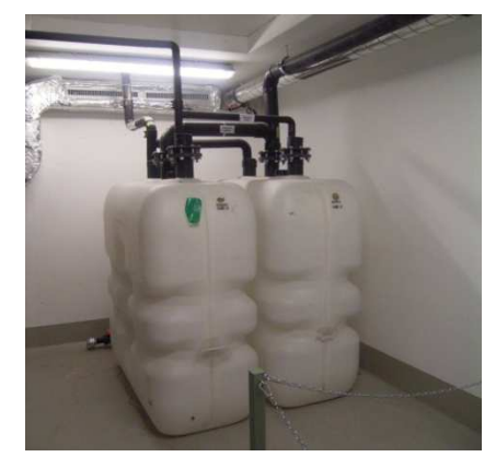
Fig. 7: The two plastic urine tanks (currently bypassed) in the school building's basement have a capacity of 1.5 \text{ m}^3 each.

with level indicators, a leakage warning system, an overflow to the sewer, and a fitting for emptying by a vacuum truck. The actual amount of urine produced is currently not measured.