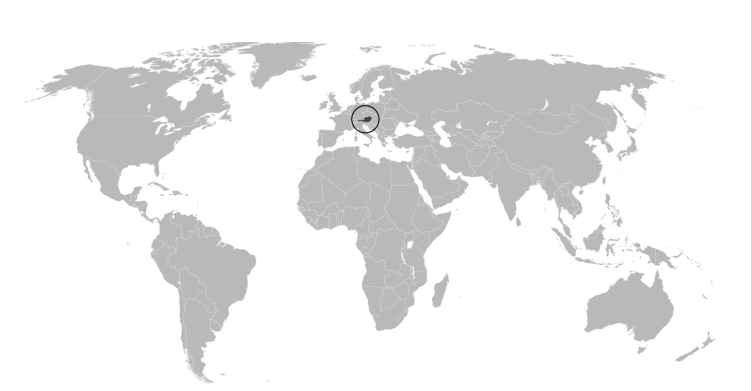
Fig. 1: Project location