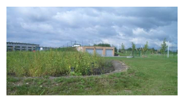
Fig. 9: Constructed wetland (reed beds) in operation.