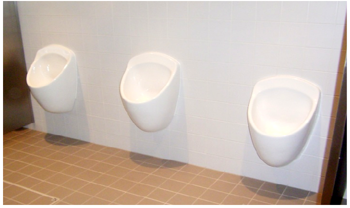
Fig. 6: Waterless urinals for boys from the Austrian company Hellbrok in the school building – hung lower than for adults (source: OtterWasser GmbH).

The waterless urinals (meanwhile widespread in many Western European countries) are also made of ceramics and supplied by Hellbrok<sup>4</sup>. The special surface prevents sticking of a urine film that could cause odours. In the model used in system 1 (school and day nursery) a liquid with lower density than water and urine works as a sealant liquid in the odour trap. It has to be refilled regularly (see section 10). The liquid is biodegradable when discharged to the sewer.