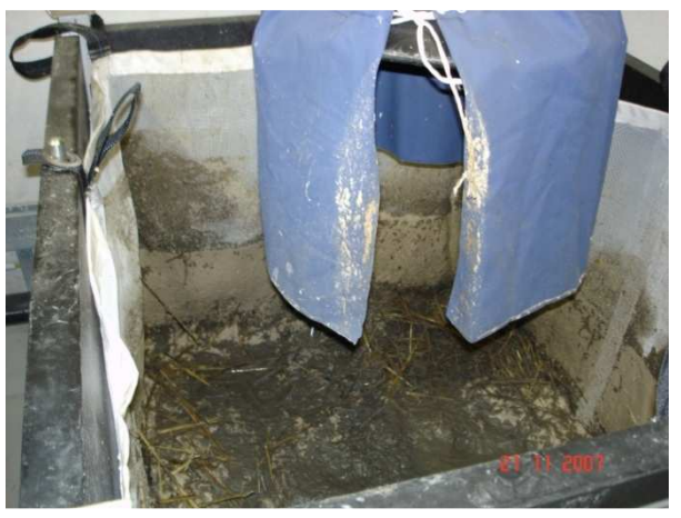
Fig. 11: Compost filter bags at trial stage, here with straw as structure material.

So far the performance of the compost filters has not been satisfactory due to clogging of the filter bags: The cellulose of the toilet paper substantially decreases the hydraulic permeability of the filters' material. Further research and optimisation work had to be conducted. Tests of different structure materials (such as bark and straw) were conducted. They showed that the adding of a pre-treatment step e.g. a settling tank would reduce the sludge load and enhance the permeability of the filter bags. The implementation of further optimisation steps will be done together with future research partners in 2009.