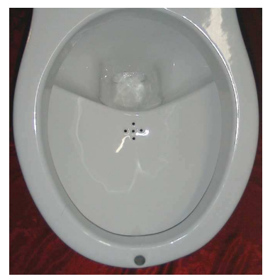
Fig. 5: Roediger urine-diversion flush toilet showing knob to activate urine valve at the front of the toilet bowl.

two different flush buttons available: 1-3 L of flushing water are used for the urine flush (volume set during installation) and 6 L for the faeces flush.