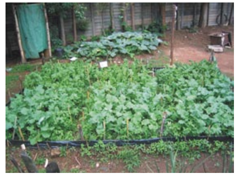
A crop of spinach four weeks after planting, using processed excreta from one family, using a Fossa alterna

Two of the three main ecosan toilet systems process the excreta in shallow pits. The third system keeps urine separate from faeces and these two products are processed separately. The methods using shallow pits are simple and relatively cheap to construct, and are thus more suited for uptake in the poorer countries of the world, where pit sanitation may already be the standard method of excreta disposal. The world of ecological sanitation has been broadened to include