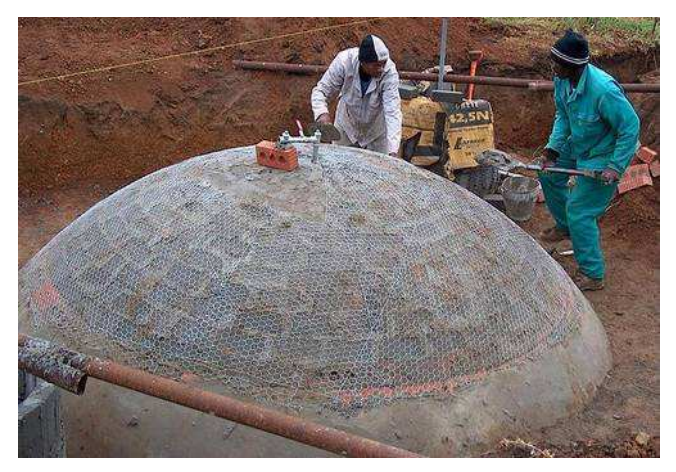
Figure 5: Construction of a fixed dome biogas plant, Lesotho.

In many Asian countries, e.g. in China, India and Nepal, human excreta are treated in this way together with animal manure and other organic waste. As a result of a Chinese national programme in the 1970s ("Biogas for every household"), addressing increasing energy demand and wood cutting, there is an on-going interest in China in biogas which is supported by the Ministry of Agriculture. For example, there are now approx. 5 million family-sized biogas plants of 6, 8 and 10 m<sup>3</sup> in operation, mainly built as fixed dome plants (Balasubramaniyam et al., 2008).