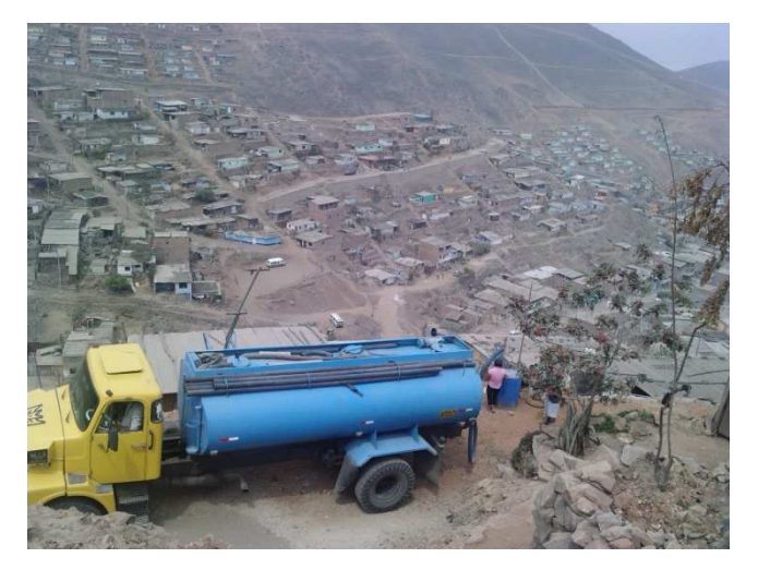
Figure 4: Tanker supplying water to low-income areas in Lima, Peru. Climate change will aggravate the existing water scarcity problems in Lima due to melting and

Adaptation measures include the planning for preparedness, prevention, protection, and response (relief and rehabilitation). Risk management and adaptation planning aims to develop different strategies based on the different scenarios, by choosing technologies that are resilient to the expected scenarios, by adapting operation and management of existing services, and by taking into consideration socio-economic factors. Furthermore, it is also advisable to separate the preparedness for extreme events and adaptation measurements from expected perpetual challenges.