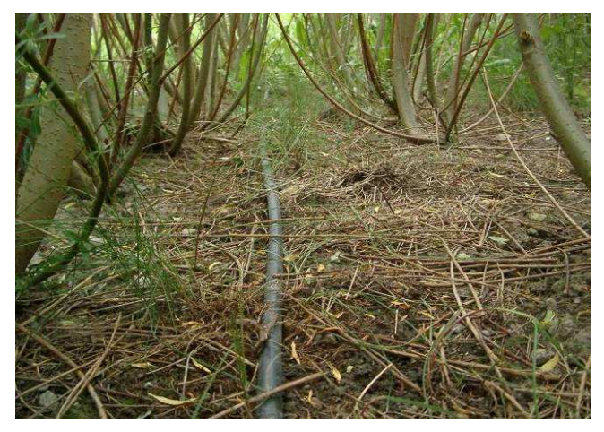
Figure 8: Short-rotation-plantation (SRP), Spain