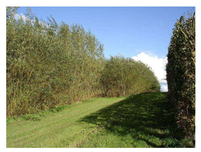
Figure 7: A two year old short-rotation-plantation (SRP) in Braunschweig, Germany, (source: TTZ, 2006).

While constructed wetlands focus on wastewater treatment only and are sealed at their base for groundwater protection, the advantage of SRPs over constructed wetlands lies in the combined wastewater treatment and the production of wooden biomass. An SRP is not lined at the base and has a filter height of between 1.0 and 1.5 m resulting in an effective reduction of pathogens. Wastewater is usually applied on SRPs by means of sub-surface irrigation in order to avoid aerosol formation and spread of pathogens by air.