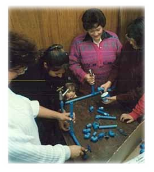
Women in an urban poor neighbourhood in Santiago de Chile are trained to become licensed plumbers for water supply and sanitation connections

sewerage coverage in poor neighbourhoods, which also introduced income generation opportunities to poor women. The four-pronged package covered the following: