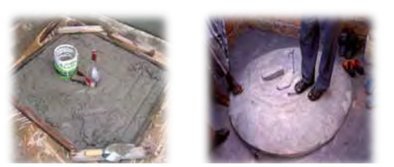
Two types of shiftable platforms; Low-cost full-cycle toilets (Photos by Jo Smet, IRC).

require only half a bag of cement, some reinforcement material (such as chicken-wire or metal wire rolled into a series of concentric circles), some hands-on training, and for the SanPlat, a casting mould. Screens fashioned from poles and plastic, bamboo, woven mats or hessian provide privacy and some protection, until the pit is full and slab and screens are shifted over a new