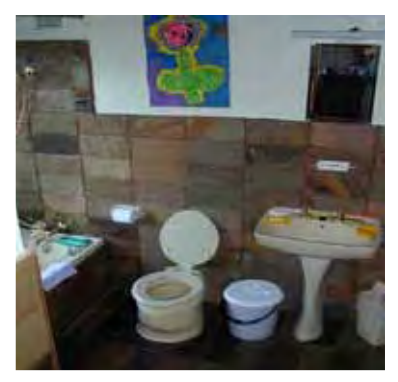
Dry toilet in bathroom in Durban