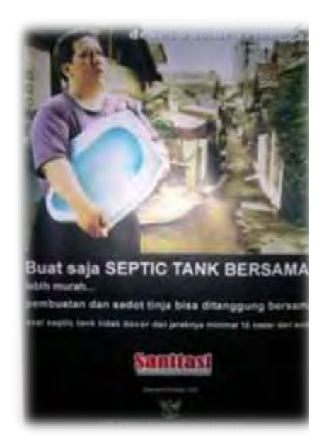
Campaign poster in Indonesia promoting male responsibility over buying a sanitary toilet for his family

A first option for taking public responsibility is that city authorities raise demand for self-financed toilets through public media campaigns. An example comes from Indonesia where such campaigns are part of the national and city sanitation strategies. The national campaign uses a gender strategy of making the installation of a toilet with a sanitary platform the responsibility of the male head of the household, because they decide on investments, but have a lower interest in sanitation than their wives.