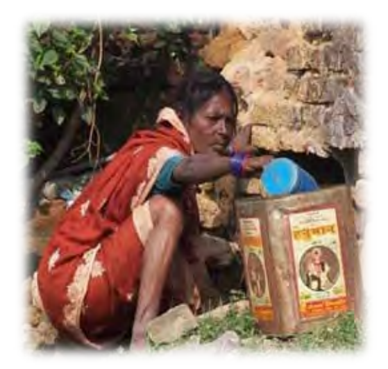
Woman scavenger emptying a toilet manually

The lowest level service for emptying pits and reservoirs is by hand, either by the households themselves or by a hired pit emptier from the informal private sector. Manual emptying, transport and dumping of human excreta and sludge are widespread. In India alone, an estimated 1.3 million poor women and men generate their income from manually emptying and carrying away toilet contents. This is also known as scavenging (Black and Fawcett, 2008), and is also common in cities across Africa (Collignon and Vezina, 2000; Eales, 2005; Mikhael and Scott, 2011).