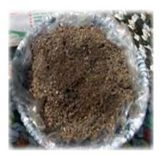
Compost from a dry toilet in peri-urban Kathmandu, Nepal

The significant advantage of composting toilets is the eradication of the necessity for removal and transport of raw sludge – an unpleasant and potentially harmful task until manual emptying can be replaced by very low cost mechanical devices which can manage the narrow paths and lanes in low-income urban settlements.