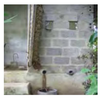
Dry toilet in back of garden in Central Vietnam

Furthermore, for the urban market it is important to offer attractive models which have a modern feel and may be situated inside a bath/shower room. Compare the attractiveness and ease of access and cleaning of the two models in the photos below.