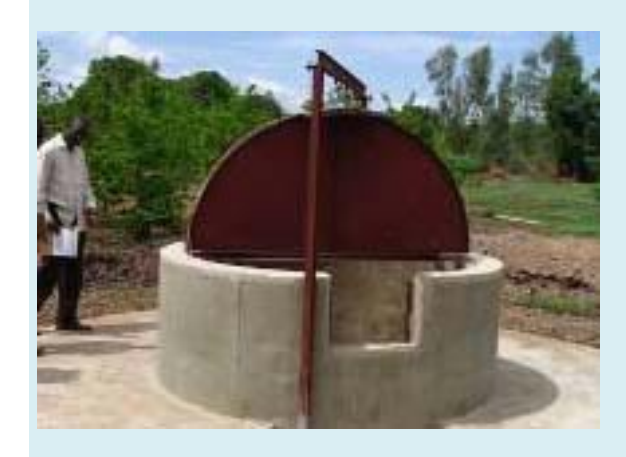
Figure 5 An accessible well in Mali

In terms of adaptation for toilets, portable wooden seats were produced for people with weak limbs (see Figure 6). These toilet seats are placed over existing traditional pit latrines and the PVC tubes direct waste into the toilet. Raised bricks or concrete next to the toilet hole allow visually impaired people to accurately guide the wooden seat over the hole. The wood is lightweight and durable, and varnished for ease of cleaning.