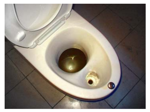
Urine-diverting porcelain toilet

training for enhanced understanding and knowledge is offered to management team members, operators, government officials and others from the local community and beyond. The apartment owner-residents also undergo training for awareness and understanding of the ecotown measures.