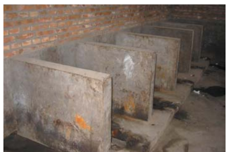
Exterior (top) and interior (bottom) of an urban public pit latrine, Dongsheng