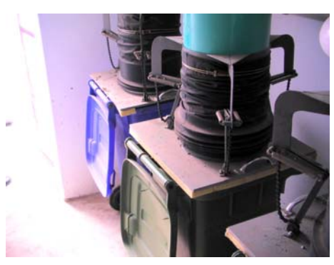
Faeces collection bins