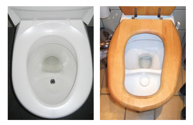
Figure 6. UD flush toilets. Left: Gustavsberg (in Meppel, the Netherlands); Right: Dubbletten (in Stockholm, Sweden); (sources: E. v. Münch, 2007).

UD flush toilets can also be combined with the concept of vacuum toilets (realised for example by the company Roediger for a pilot project in Berlin Stahnsdorf and by the Swedish company Wost Man Ecology, see Appendix ). This type of toilet collects urine and a small, concentrated amount of brownwater (faeces with about 1 L of flush water).