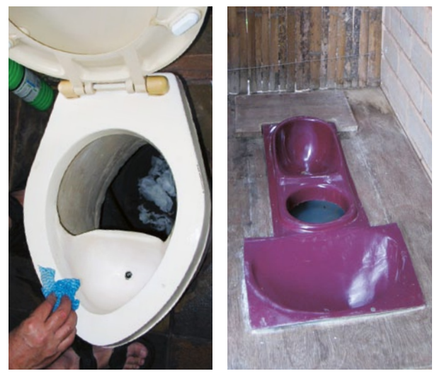
Figure 5. left: Indoor UDDT (pedestal type) in Johannesburg, South Africa in the house of Richard Holden. Right: UDDT squatting pan in Bangalore, India, with three holes: the area in the front is for anal washing, middle is for faeces and back is for urine.

The anal washwater can be infiltrated in a gravel filter or treated together with greywater in a subsurface constructed wetland. UDDTs are especially popular wherever there is water scarcity and a demand for cheap fertiliser. They can be built indoors or outdoors.