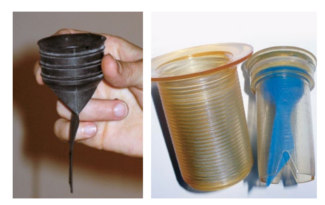
Figure 2. Two types of odour seals for waterless urinals. Left: Flat rubber tube (Keramag Centaurus). Right: (left side) See-through pipe fitting; (right side) see-through EcoSmellstop (ESS) unit showing the blue silicon curtain one-way valve inside.

The ESS manufacturing process is not simple as the injection moulds are of extreme complexity, and the mixing and injection requires very sophisticated machinery. For this reason, it is not yet possible to manufacture the ESS locally in developing countries, but it can easily be imported as it is small, light-weight and low-cost. This patented ESS unit is used by the companies Addicom, Kellerinvent AG and F. Ernst Ingenieur AG<sup>15</sup> since 2006.