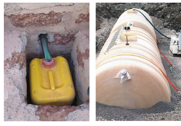
Figure 7. Left: Low-cost solution: 20 L plastic jerrycan for urine storage at individual toilet level in Ouagadougou, Burkina Faso. Note: it might be quite difficult to lift up a full jerrycan out of this enclosure. Right: Below-ground plastic urine storage tanks at Kullön, Sweden during the construction process. The tanks will be covered with soil.

Examples for urine storage tanks of different sizes are shown below.