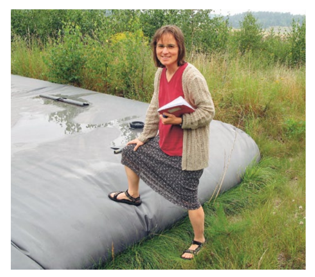
Figure 8. Urine storage tank made of a 150 m<sup>3</sup> plastic bladder at Lake Bornsjön near Stockholm, Sweden.