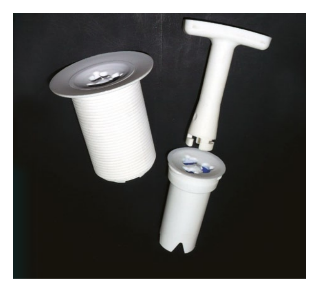
Figure 3. EcoSmellstop (ESS) unit with pipe fitting and extractor. Inside the ESS is the silicon curtain valve.