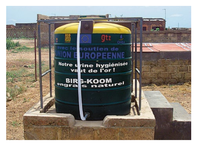
Figure 9. Plastic urine storage tank in Ouagadougou, Burkina Faso as part of the EU-funded project ECOSAN_UE led by CREPA.