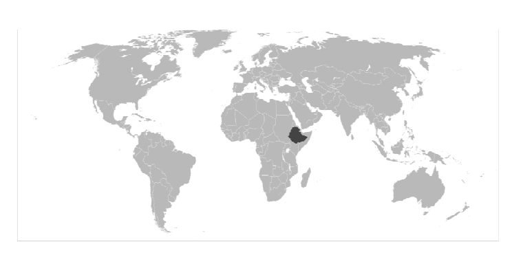
Fig. 1: Project location