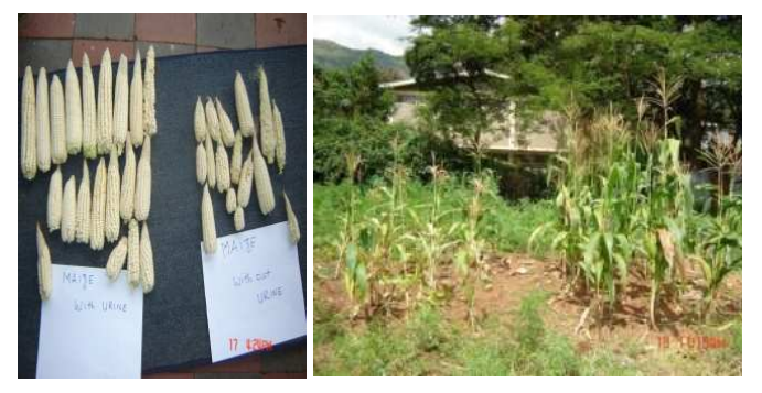
Fig. 5: Maize fertilised with urine

The possibility of reuse was one of the main motivations for ROSA (Figure 4). The team supports the toilet owner in reusing the toilet products in his farm irrigated by a river called Kulfo. He has applied doses of urine for the banana, mango and lemon plants and the dried excreta were co-composted along with the organic material in his farm land. The yield was not estimated and the preparation of the compost was as the faeces container fills.