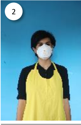
Put on mask