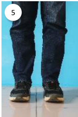
Wear boots/ wader suit