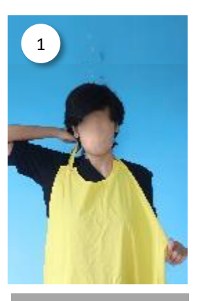
Put on apron