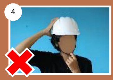
Do not touch the helmet with dirty hands