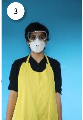
Put on goggles