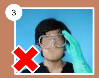
Do not touch goggles with dirty hands

Place over face and eyes and adjust to fit