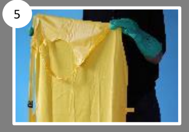
Remove the apron with gloved hands