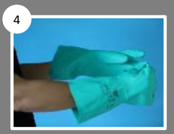
Grasp the outside of one glove at the wrist. Do not touch your bare skin