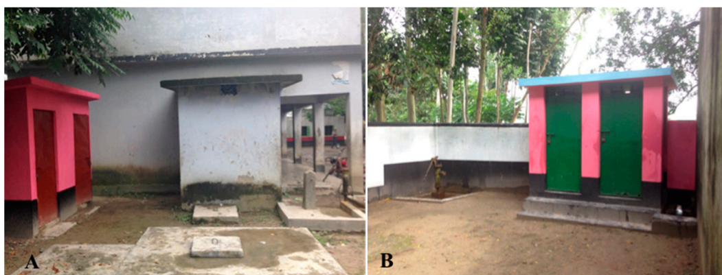
Figure 1. School latrine and water infrastructure prior to nudges in School (A) and School (B).