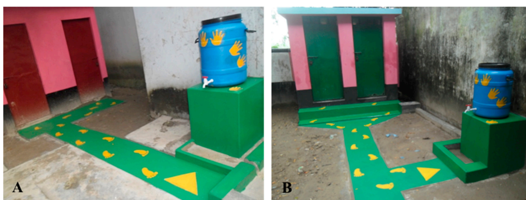
Figure 2. Nudges following final phase of construction, including: dedicated handwashing station, paved paths, and painted foot—and handprints in School (A) and School (B) (photo taken immediately following construction and prior to soap being made available during the next school day).

For direct observations, trained staff positioned at discreet locations on school grounds completed structured observations of handwashing practices after leaving the school latrine, specifically if the children washed both hands and whether soap was used. Observations were completed at baseline (prior to construction), 1 day after each infrastructure and nudge installation (HW infrastructure, brick paths, and painting) and 2 and 6 weeks after the intervention was completed. Each observation period consisted of one full school day, typically ranging from 8 am to 3 pm. Observers were allowed to take short breaks during observations during periods when students were in class. Observers were given extra soap to place either at the handpump (at baseline) or at the handwashing station if supplies were not available that day, although this was only necessary during baseline observations.