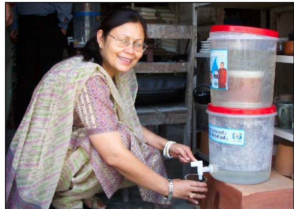
Ceramic Candle Filter

Pathogens and suspended material are removed from water through physical processes such as mechanical trapping and adsorption.