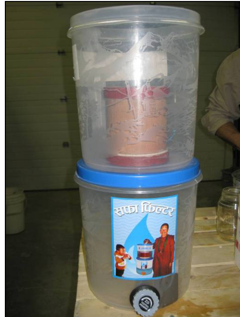
Filter with one ceramic candle

The candles should be regularly cleaned using a cloth or soft brush to remove any accumulated material. It is recommended that the candles be replaced every 6 months to 3 years, depending on the manufacturer's instructions and quality of the candles. This is in part to protect against fine cracks which may have developed and are not be visible. Any cracks will reduce the effectiveness since water can short-circuit through the crack without being filtered through the ceramic pores.