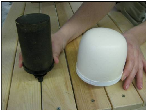
Different types of ceramic candles