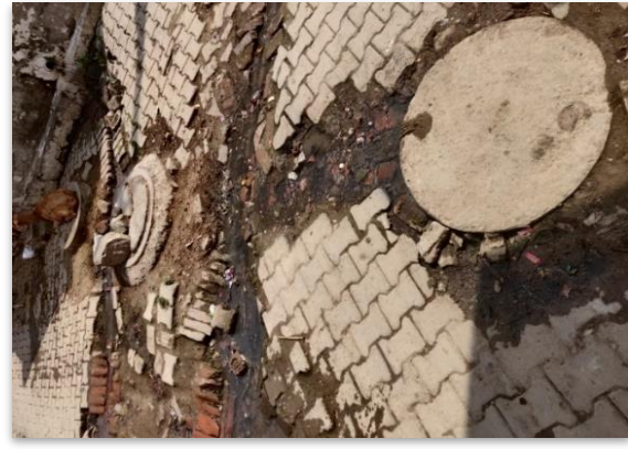
Choked sewer line