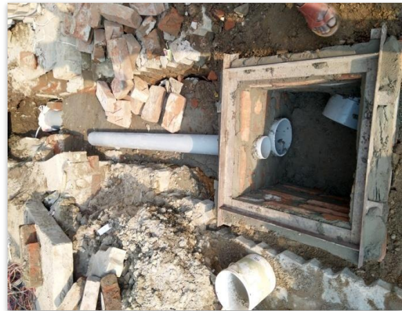
HH being connected to sewer chamber