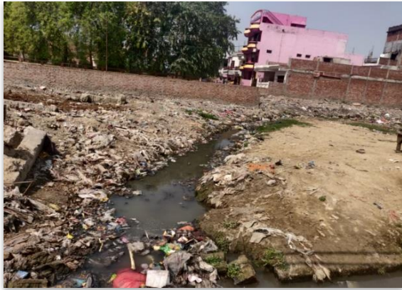
Open drain ending at open ground

pertinence of location. These private desludgers advertise their contact number by distributing business cards or posters on wall. On an average, private vacuum tank, cumulatively complete 1-2 trips per day, monsoon being the peak season for emptying. On an average, it takes about 1–2 hours for completing one trip depends on the distance covered during the trip. As per KII with the vacuum tanker operators, manual emptying is also prevalent in the city.