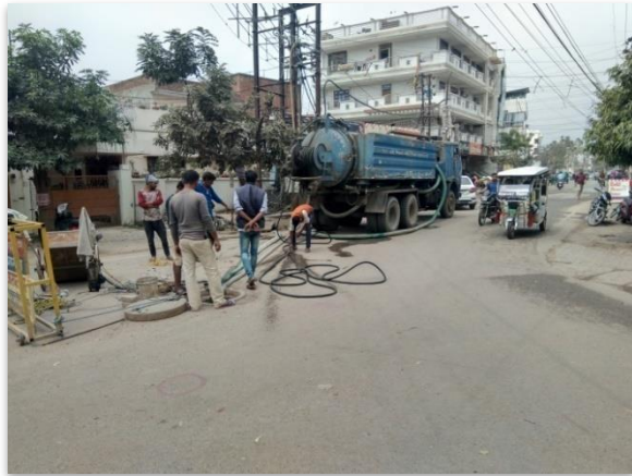
Jetting Machine Cleaning the Sewer Line