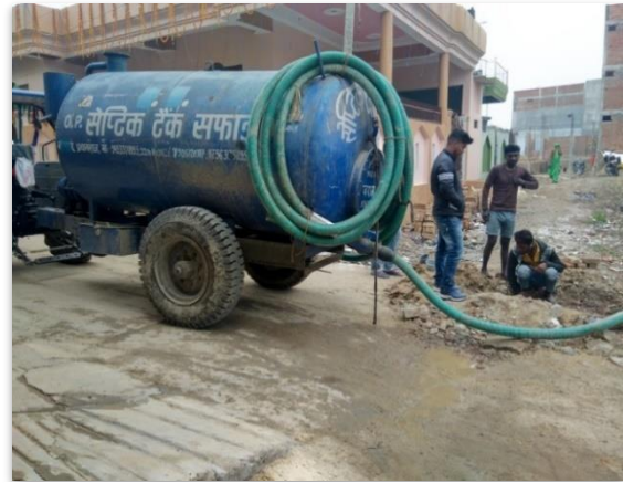
Vacuum Tanker involved in emptying process