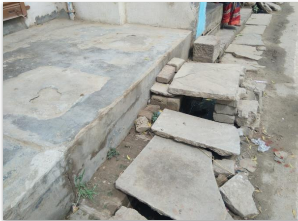
Septic Tank of a Household

In Prayagraj, 55% of the population is dependent on the offsite sanitation system and 45% of the population depends on onsite sanitation system (OSS). Customarily, the population dependent on OSS have constructed either septic tanks or fully lined tank (with outlets), lined tanks with open bottom. Any kind of lined tanks (with outlet) with baffle wall in between (2-3 chamber) connected to toilets are locally called septic tanks irrespective of whether it adheres to the design specifications prescribed by Bureau of Indian Standards (BIS) or not and Lined tank (with outlet) without baffle wall is considered as fully lined tank. As per Focused Group Discussion (FGD) with masons and with field observation, it was observed that, septic tank was more prominent as compared to fully lined tank. Fully lined tank was observed particularly in areas of Low-Income Group (LIG) or in old areas of Prayagraj. As 55% of the city is connected with sewer network, there are still houses who have connected their septic tank outlet to the sewer system whose percentage after field observation and interviews with relevant stakeholders comes out as 23%. The size of the containments is usually decided on the basis of space availability and affordability of the households. Due to no standardization being followed while constructing the containment system, few households have constructed their containments large in capacity irrespective of their household size.