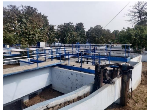
Figure 5: Sewage Treatment Plant of Prayagraj at Naini