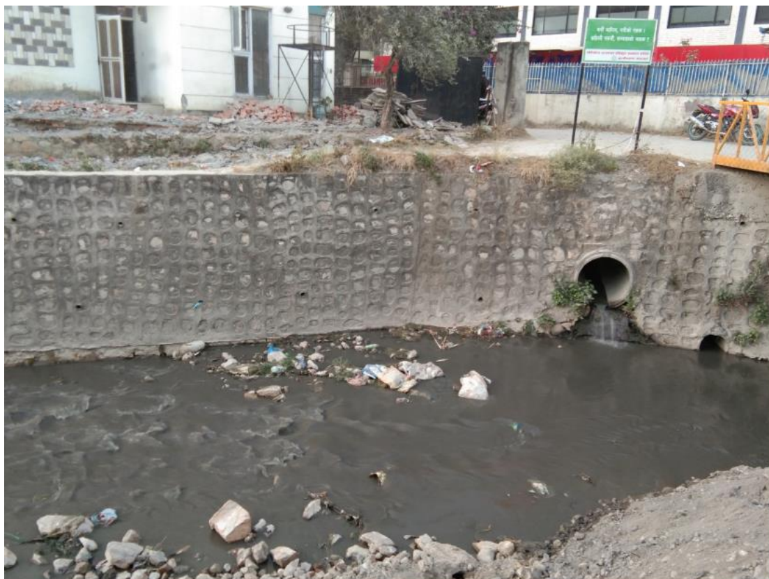
Figure 3: Wastewater and supernatant discharged into Dhobi River untreated.

Manually emptied faecal sludge is disposed by the household member or labour themselves in their household premises or in the field. All the wastewater, supernatant and emptied faecal sludge are finally discharged in Bishnumati and Dhobi Rivers, as well as in other rivers of Kathmandu Valley (KII1 and KII4, 2019).