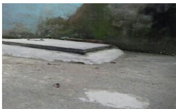
Figure 2: Containment system with manhole cover (HHs survey, 2019).

As presented in Table 1, most of the population are dependent on the sewer system (T1A1C1, 71%), followed by fully lined tanks (T2A3C5, 9%; T1A3C8, 1%, T1A3C9, 5% and T1A3C10, 5%), lined tanks with impermeable walls and open bottom (T2A4C5, 1%; T1A4C8, 1% and T2A4C10, 2%), septic tanks (T1A2C2, 1%, T2A2C5, 1%), user interface directly connected to open drain (T1A1C6, 2%) and lined pits with semi-permeable walls and open bottom with no outlet and overflow (T2A5C10, 1%). As per the household survey (2019), the average size of the containments is 7m 3 .