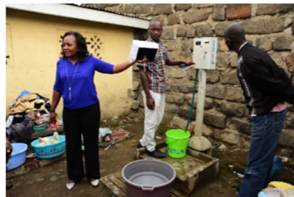
A pre-paid yard tap on a shared plot in Nakuru

KSH 8.7 billion SPENT IN TOTAL INVESTMENTS