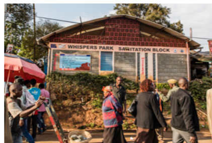
A public sanitation block built with WSTF funds