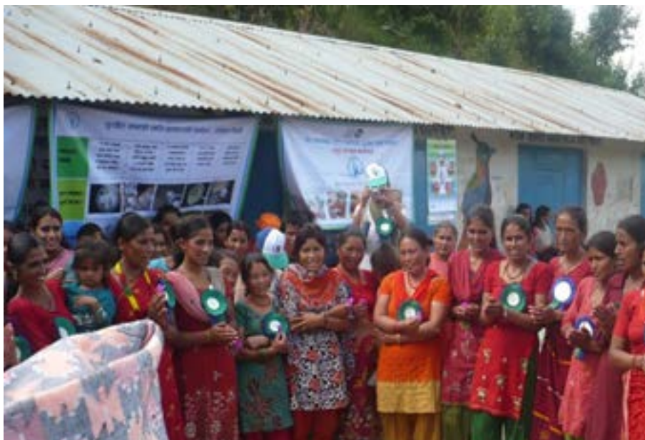
Mothers publicly committing to practise food hygiene behaviours in the Nepal intervention-study.