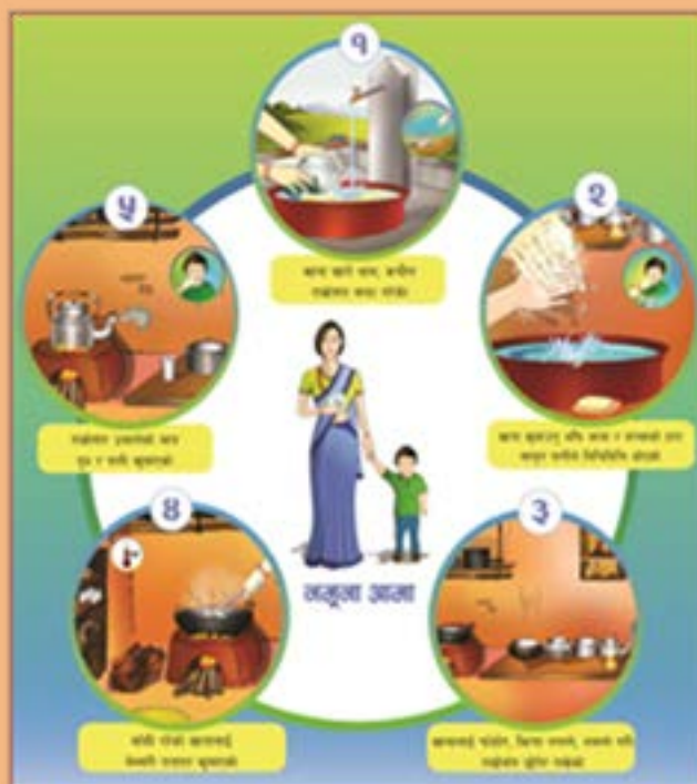
Five key food hygiene behaviours promoted in Nepal.

Building on the Mali and Bangladesh findings, SHARE funded the design, delivery and evaluation of an intervention to change the food hygiene behaviours of mothers in rural Nepal [28]. This consisted of a motivational package targeting five key food hygiene behaviours using emotional drivers rather than cognitive appeals, as well as emphasis on change in behaviour settings. Four clusters received the intervention over a period of three months whilst four clusters remained a control group. Outcomes were measured in 239 households with a child aged 6-59 months. 43% of mothers were able to maintain all 5 key behaviours and the intervention was successful in significantly improving the microbiological indicators in complementary foods. The results suggest that it is possible to substantially improve food hygiene behaviour and reduce the risk of microbiological contamination of complementary foods through scalable community level interventions.