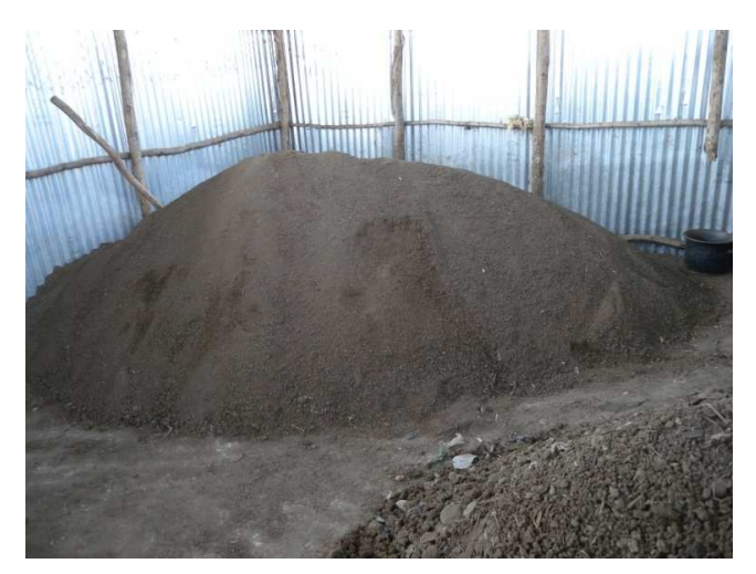
Figure 4: Sieved co-compost at the composting station of "Engan New Market Compost Production Youth Association" in Arba Minch, Ethiopia, ready to be used in the tree nursery or sold as organic soil conditioner.