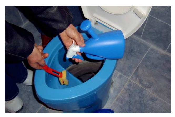
Figure 7: Cleaning a UDDT in a public cultural house in Stara Zagora, Bulgaria. Project was implemented by Earth Forever Foundation and WECF.

Such an institution which is accepted and recognised by the community and which assists with the O&M tasks ensures the long term success of sustainable sanitation.