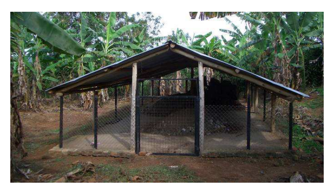
Figure 3: Drying shed for faecal matter from UDDTs at Kalungu School, Uganda. The caretaker has to take the containers with faeces from the UDDTs to this shed.

O&M activities are entirely managed by the school. The school administration has employed a caretaker who is responsible for most of the O&M activities. Furthermore, students are fully involved in O&M. They are organised in groups which have different tasks such as cleaning the toilets, removing containers from the UDDT vaults and fertilising of plants. Teachers are responsible for training and awareness creation among pupils.