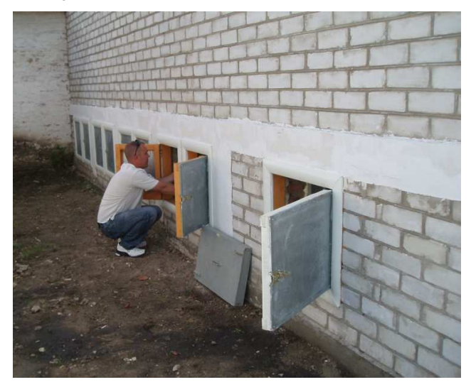
Figure 8: Inspection of the faecal chambers of a UDDT school toilet block in Nizhyn, Ukraine, constructed by the local NGO Mama86.

Such an institution which is accepted and recognised by the community and which assists with the O&M tasks ensures the long term success of sustainable sanitation.