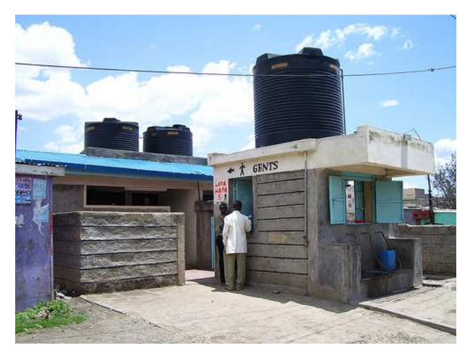
Figure 6: Naivasha public toilet with water kiosk. In front is the water kiosk that functions as an operator room. Customers pay at the side window, where the two people are standing. Behind them the gents section of the toilet can be seen<sup>3</sup>.

The Naivasha public toilet was financed by the Water Services Trust Fund is owned by the public Regional Water Services Boards and run by the local water services provider (privatised water utility). The utility has contracted a private operator to run and operate the toilet on a day-today basis. The public toilet consists of flush toilets connected to a biogas plant which discharges the pretreated wastewater to a sewer.