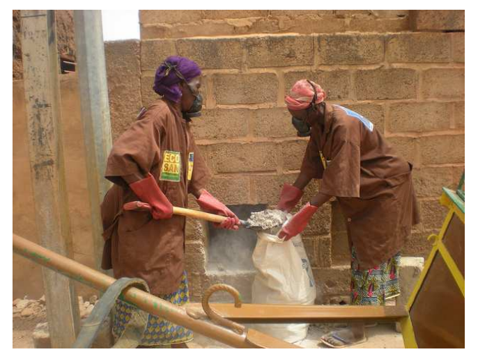
Figure 1: Two staff members from a service provider are emptying the faeces vaults of household UDDTs in Ouagadougou, Burkina Faso<sup>1</sup>.

when the sanitation facilities operate continuously and at full capacity in compliance with acceptable standards of quantity and quality. Therefore, O&M tasks must be carried out effectively and efficiently.