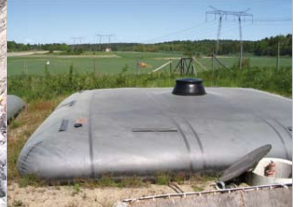
Figure 11: Rubber tanks for storage of urine

Figure 10: Urine tanks for a neighbourhood during construction in Kullön, Vaxholm.