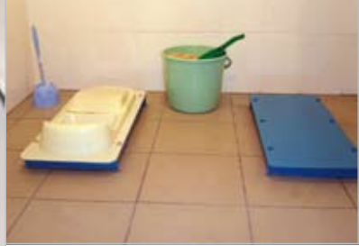
Figure 2: A urine diverting toilet seat. Photo by WECF

Figure 3: A urine diverting squatting toilet. Photo by WECF