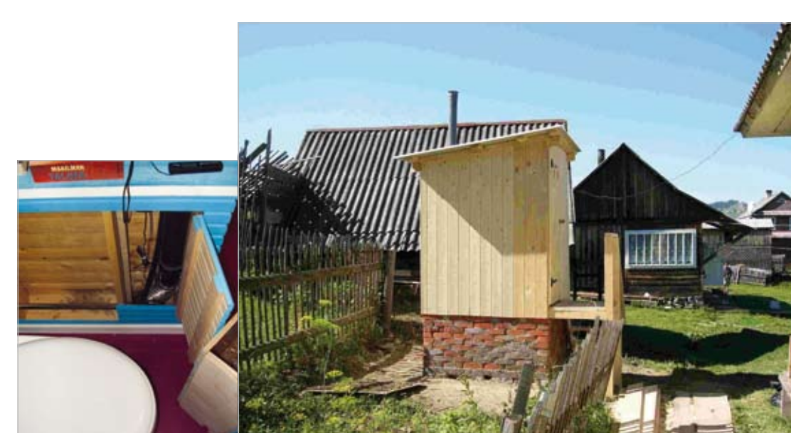
Figure 13: Maintenance hatch for toilet system fan.

Figure 14: Even for an outdoor setting is a ventilation pipe. relevant