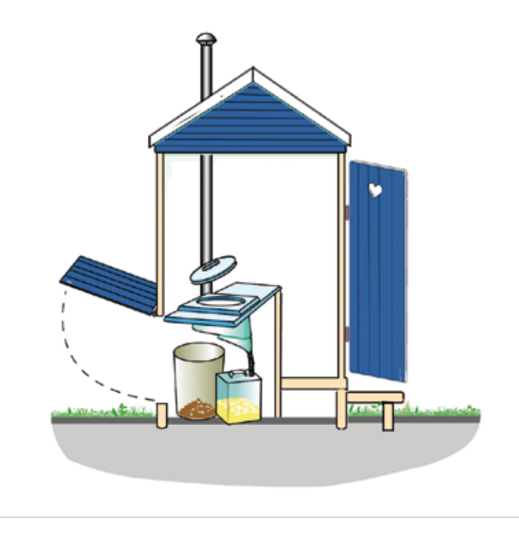
Figure 5: Urine-diverting liner for dry urine diverting toilets in summerhouse settings. By Palmcrantz and Co