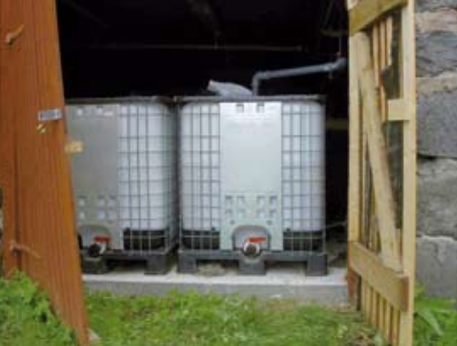
Figure 9: One cubic meter tanks suitable for storage of urine.

Figure 8: Hand pumping of urine from household tank for subsequent use in garden.