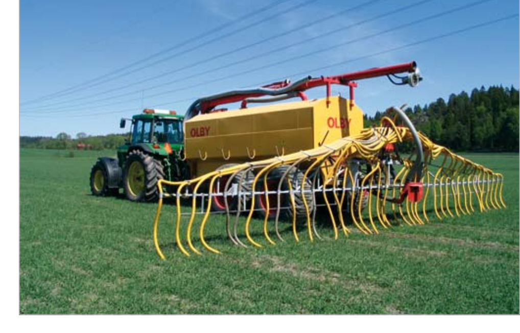
Figure 16: Large scale application of urine using a slurry spreader with trailing hoses.