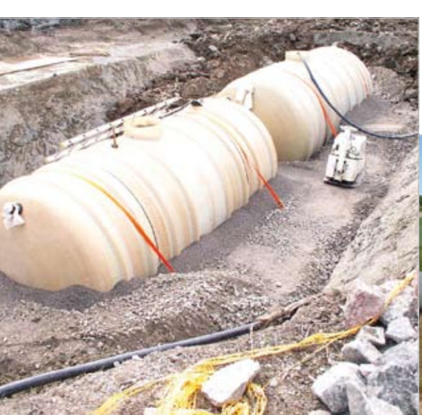
Figure 10: Urine tanks for a neighbourhood during construction in Kullön, Vaxholm.

Most of the urine that is collected in small systems around Sweden is transported to farms where it is poured into the slurry storage. This is a simple way of handling small fractions of urine, however if one wants to make use of the nutrients in an efficient way and there are larger amounts available, designing storage and spreading according to nutrient potential in urine is better.