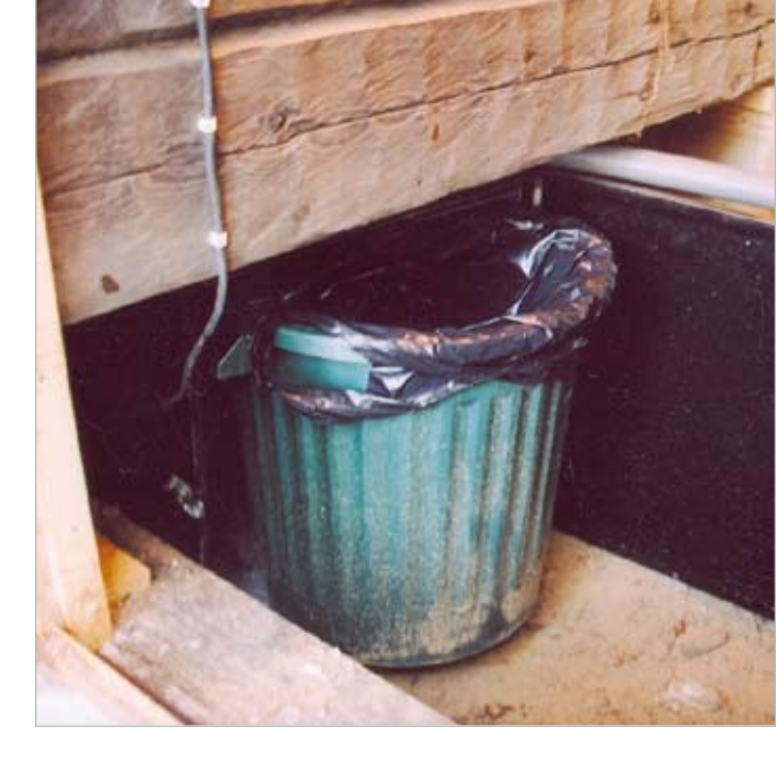
Figure 12: Plastic container for collection of faeces, lined with a black plastic bag.

Great care should be taken and the regulations issued by the proper authority on occupational safety and health should be followed if it is necessary to go down into the urine tank, and this task should never be undertaken by one person alone.