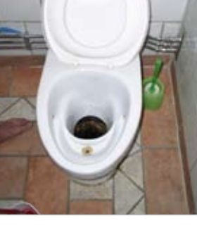
Figure 25: The sanitation system is unique; a urine diversion system with dry collection of feces in a 2-storey building.

Figure 26: The faeces are composted in a closed bin together with grass and leaves.