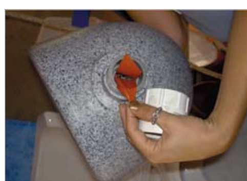
Figure 6: Rubber membrane as odour seal.

Figure 7: Cleansing tools for urine piping in a urine diverting toilet.