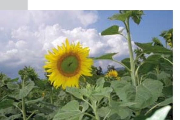
Figure 4: The reuse of sanitised human excreta in agriculture often falls outside of the existing regulatory legal framework

The specific benefits of the closed loop approach should be communicated and promoted in such a way that the advantages of ecological sanitation, compared to other available sanitation systems and approaches as well as to the "business as usual" alternative, become very clear to decision-makers and politicians.