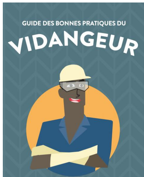
Manual on good emptying practices