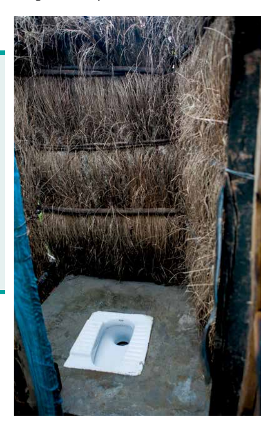
Village Khemji, Warora Block, Dist. Chandrapur. A home made toilet whose walls are made out of grass stacks is seen in Khemii.

1 Working group leads: Drinking water: WaterAid and International Water and Sanitation Centre (IRC); Sanitation: World Bank Water and Sanitation Program; Hygiene: US Agency for International Development (USAID); Equity and non-discrimination: UN-SG Special Rapporteur on the Human Right to Water and Sanitation/Office of the High Commissioner on Human Rights (OHCHR).