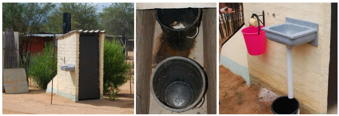
Fig. 2: Left: Otji toilet in Omaruru; Middle: Perforated faecal containers in the vault; Right: Basic handwash basin attached to the toilets. The pink bucket provides fresh water, the cup is used to fill the basin and the black bucket collects the greywater which can be used for irrigation (photos: F. Kleemann, GIZ, 2011).

As mentioned above, the toilets were partly prefabricated by the CHP. The most important parts were made from metal (steel vault lid, door, doorframe, roof structure, ventilation pipe, steel foundation ring) and concrete (floor plates, side plates for vault lid). Apart from that, the toilet bowl and materials such as screws, nuts, silicon and wire were also used. For the toilet super structure, bricks, cement and sand were used. The roof tiles were also fabricated by the CHP and designed to keep the toilet cool.