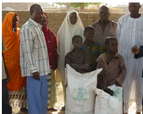
Figure 3: Fertiliser bags brought along to illustrate annual nutrient amount present in excreta from one rural family in Niger.

An estimate of the value of plant nutrients in human excreta can be made based on the local cost of synthetic fertilisers with an equivalent quantity of nutrients. Such an estimate for urine in Burkina Faso was 7.5 EUR per person per year (Dagerskog and Bonzi, 2010) and in the case of the Philippines around 3.1 EUR per person per year (Gensch, et al, 2011). 3 To give another example: the average rural family of 9 in Niger excretes annually the nutrient equivalent of 100 kg (2 bags) of synthetic fertilisers (Dagerskog and Klutse, 2009).