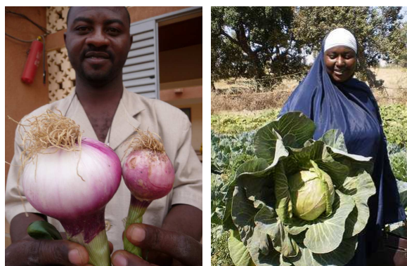
Figure 4: Increased vegetable crop yields when using urine as fertiliser in “Productive Sanitation in Aguié Project”. More photos: www.flickr.com/photos/qtzecosan/sets/72157627175906041.