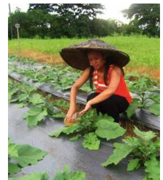
Figure 1: Left: Greywater towers in Arba Minch, Ethiopia. Right: Urine applied on petchay crops in Cagayan de Oro, Philippines.

How long exactly the phosphorus and potassium reserves will last is hotly disputed as estimates depend on many factors, like the potential discovery of new reserves, increasing population growth and demand, increasing difficulty to extract reserves, and related market price developments (Cordell et al., 2009; UNEP, 2011). One additional concern is that lower grade phosphorus which might increasingly be mined in the future is often contaminated with radioactive uranium.