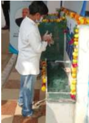
Foot Operated HWWS in schools