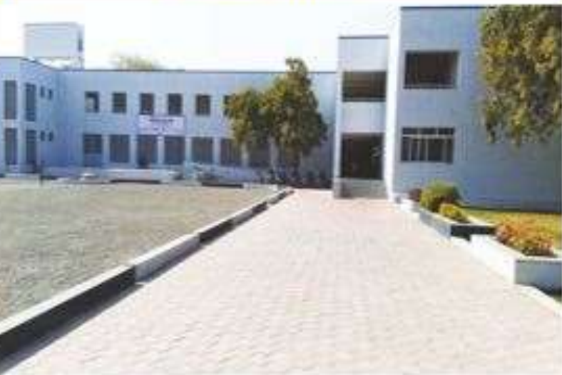
DAMNAGAR PAY CEN. SCH.1, SCHOOL AMRELI GUJARAT