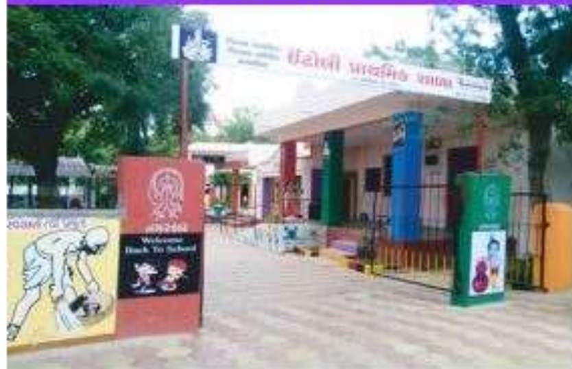
LANTOLI PRIMARY SCHOOL, VADODARA GUJARAT