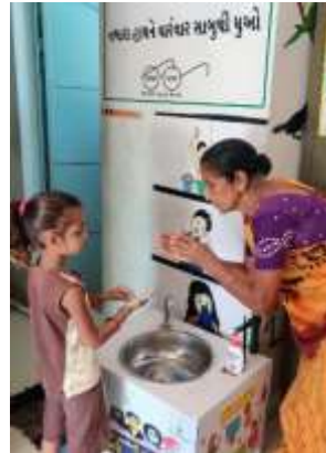
Child Friendly HWWS for AWCs