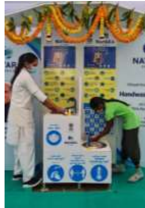
COVID compliant HWWS in HCFs