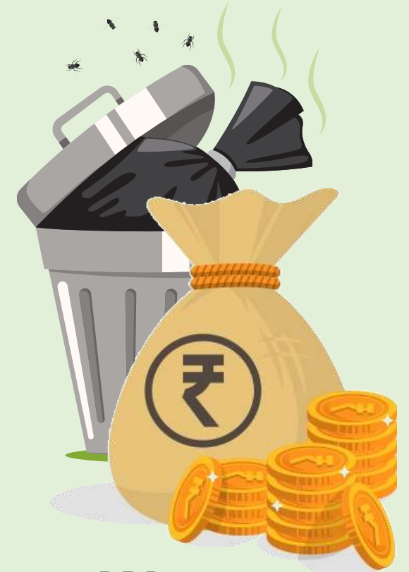
Waste to Wealth