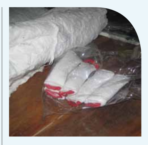
Pad manufacturing centre, the woman in the picture earns income manufacturing and selling pads. She can make and sell the pads at a much lower price than those previously available.

'Now through working with these groups, women, youth leaders, adolescent people and children are also represented. So adolescents can now voice their needs about their menstrual situation or privacy in latrine or bathroom facilities.'