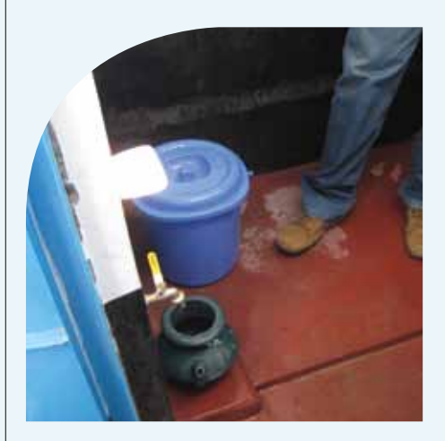
Facilities in school with extra space and washing equipment. Also a hook to hang clothes and/or bags from to keep them dry while washing.

"Instead of forming a new Community Based Organisation (CBO) which could create conflict, we use existing groups but undertake advocacy within the groups to add personnel, especially youth, extremely poor people and other excluded groups. Previously the CBOs were dominated by older men who were generally already community leaders. Now through working with these groups, women, youth leaders, adolescent people and children are also represented. So adolescents can now voice their needs about their menstrual situation or privacy in latrine or bathroom facilities. The women also have direct access as they are in the committee. So they can say what they need separately for their own dignity and privacy. So within the existing system we are gradually trying to incorporate people who were not included previously. Through an evolutionary process this changes the community leadership also. So now there are new leaders working with old leaders, working together."