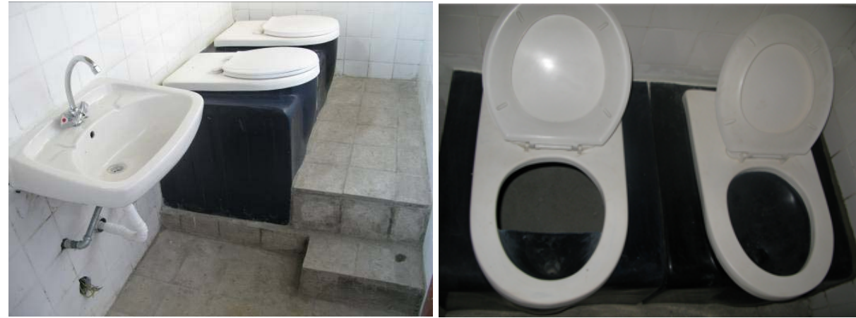
Figure 2: Double vault system in the bathroom

urine containers entering into the bathrooms, a smell trap (i.e. made by rubber) is integrated into the urine pipe. The boxes for collection of faeces are dimensioned in such a way that a family of five persons can use one box for half a year. Households are advised to use ash, which is widely available as a result if Ethiopian cooking habits, or other dry material like dry soil for covering the faeces after every use and improving the drying process. After the first box is filled, the second box is used while the contents of the first box are allowed to dry. During this time the first toilet may be used as a urinal by addition of a urinal bowl.