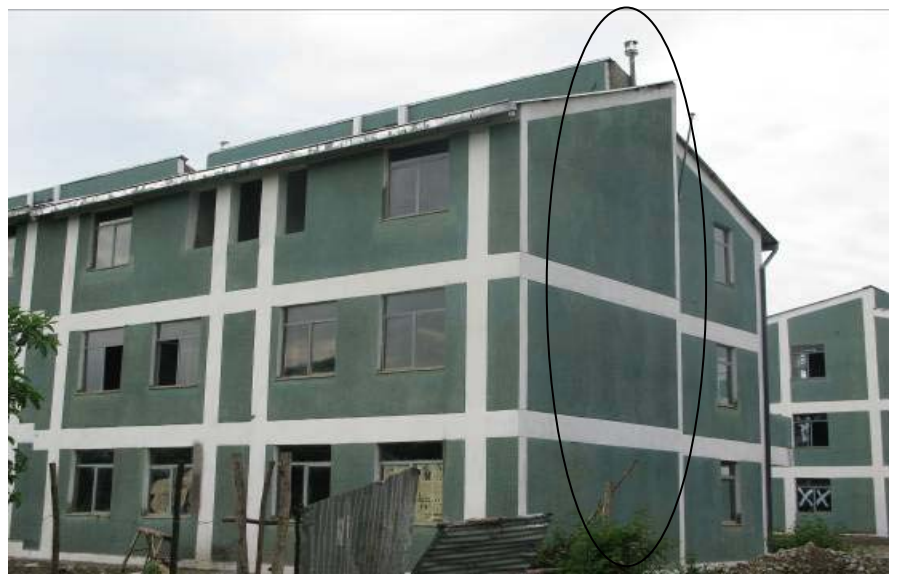
Figure 3: Collection shaft with ventilator at the outside

Ventilation is ensured by switchable ventilators at the back of the toilet box as well as by a wind-driven ventilator on top of the shaft (see figure 3). When the second box is full, the contents of the first box are emptied via a shaft at the rear of the toilet and collected at the bottom of the shaft in containers. Access for emptying the toilet box is via the removable lid at the top of the box. Micro and small enterprises will be responsible for the emptying and transport of the dry matter as well as of the urine. Post-processing such as co-composting of faecal matter and organic waste will be carried out before the human excreta products are used in local agriculture.